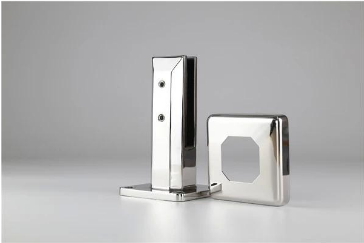
Glass Spigot in Mirror polished :