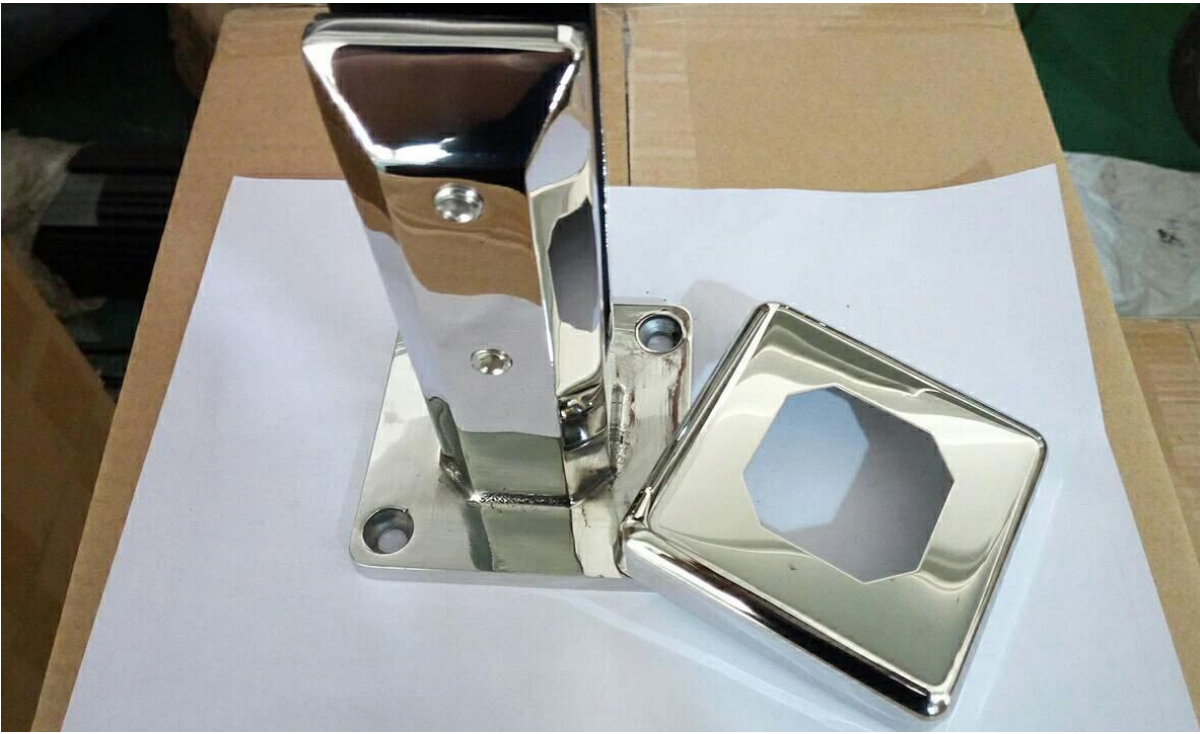
Glass Spigot in Brushed / Satin finished :