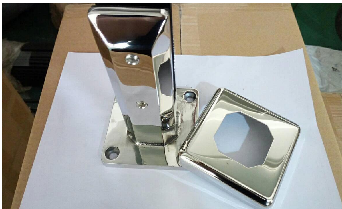
Glass Spigot in Brushed / Satin finished :