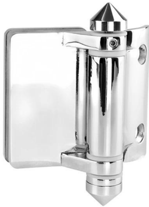
Packing photos of Stainless Steel Frameless Glass Pool Gate Hinges -