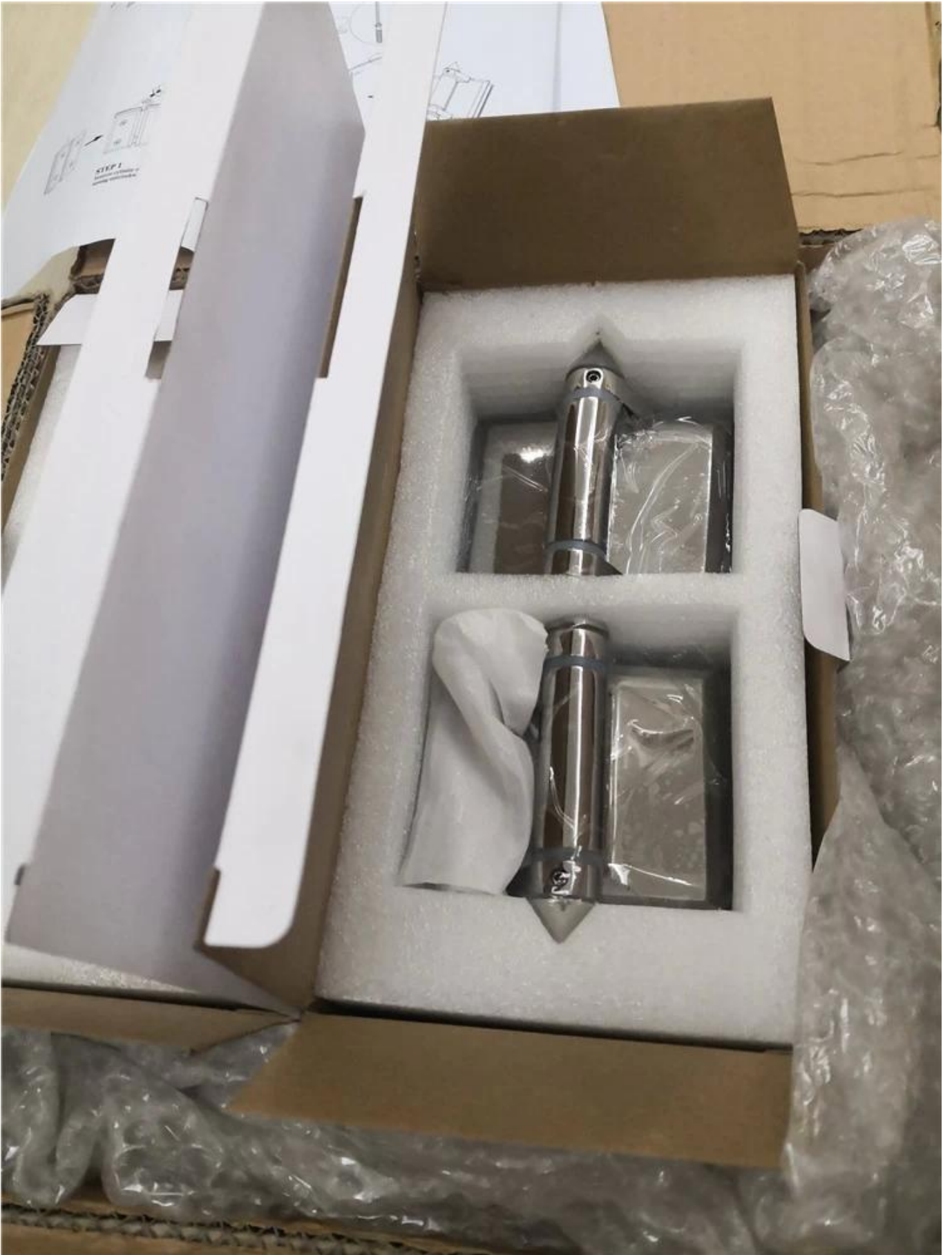
Company profile -