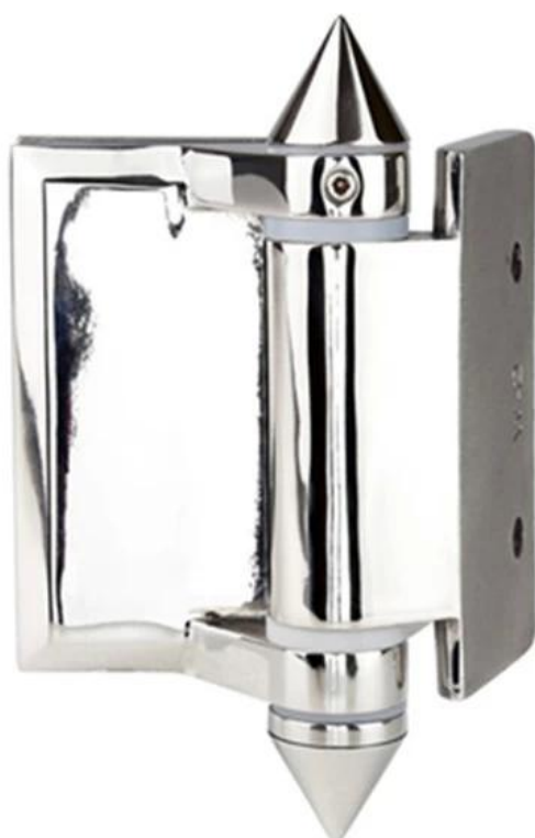
Glass to round post hinge-