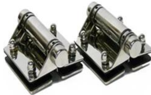
6. tempered glass