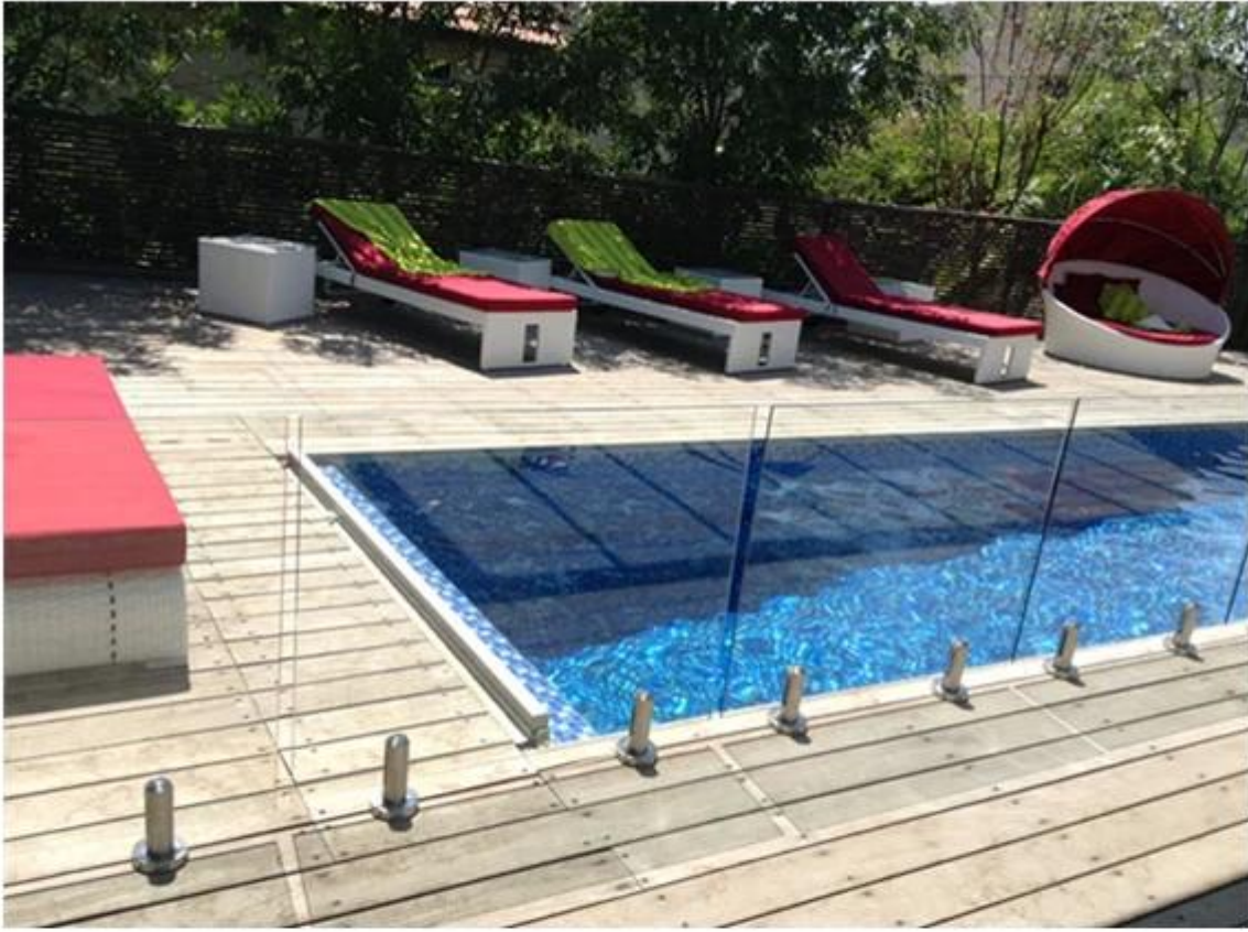
frameless glass balustrade