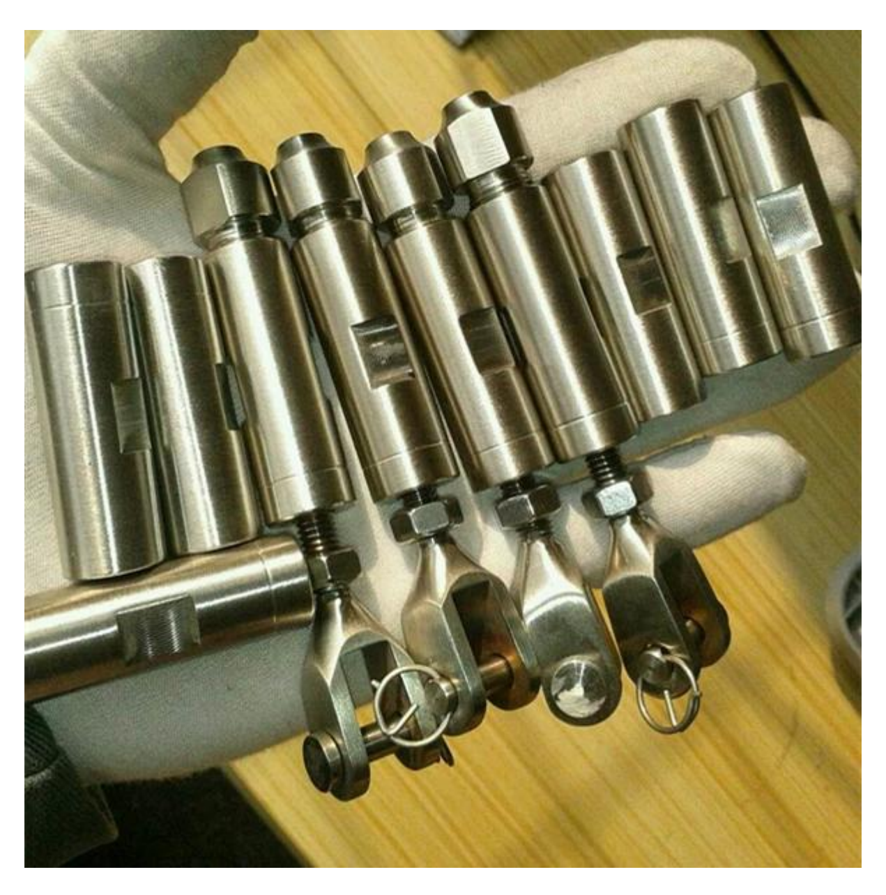
Project in L.A California