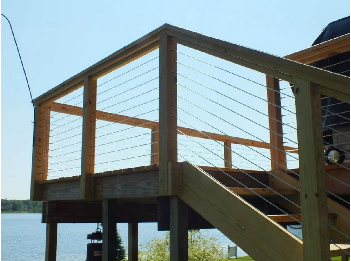
T803 , highly recommended type, popular in USA, Canada Click the picture below for more information;