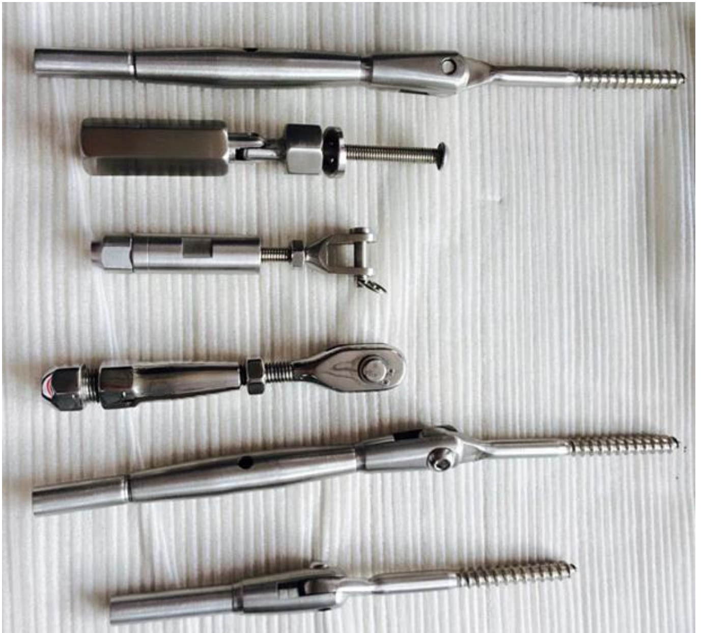
Cable baluster posts: