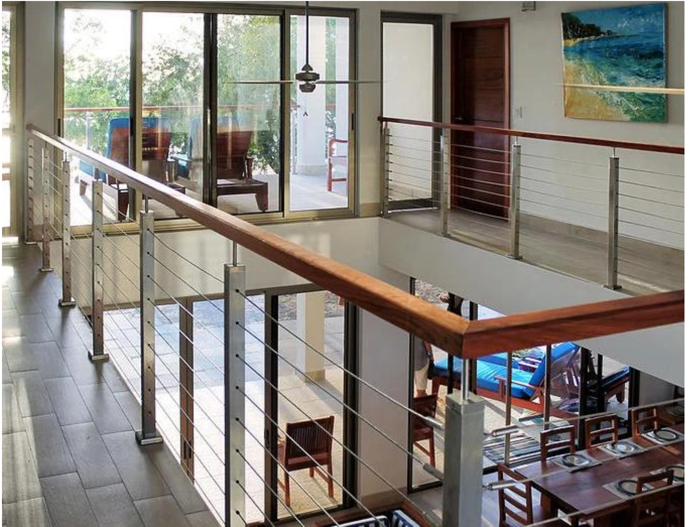
Cable tensioners / Cable fittings: