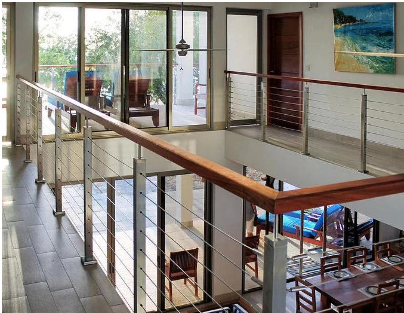
Cable tensioners / Cable fittings: