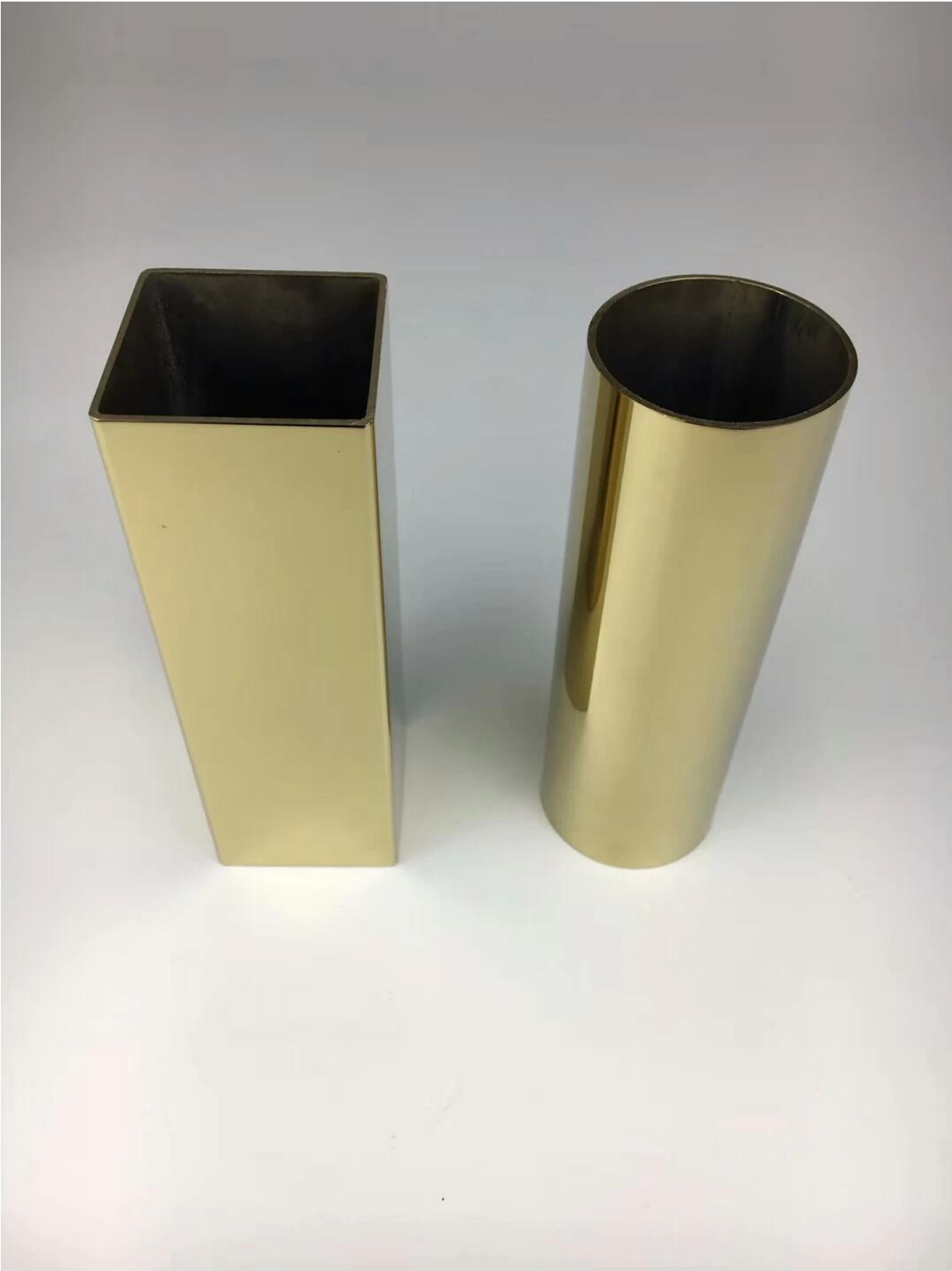
Normal mirror and satin finish stainless steel tube pipe