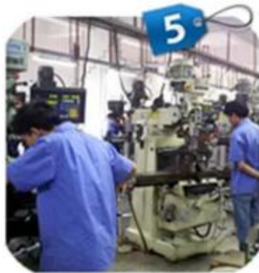
Drilling & Tapping