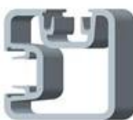
Square 2 way 90 degree