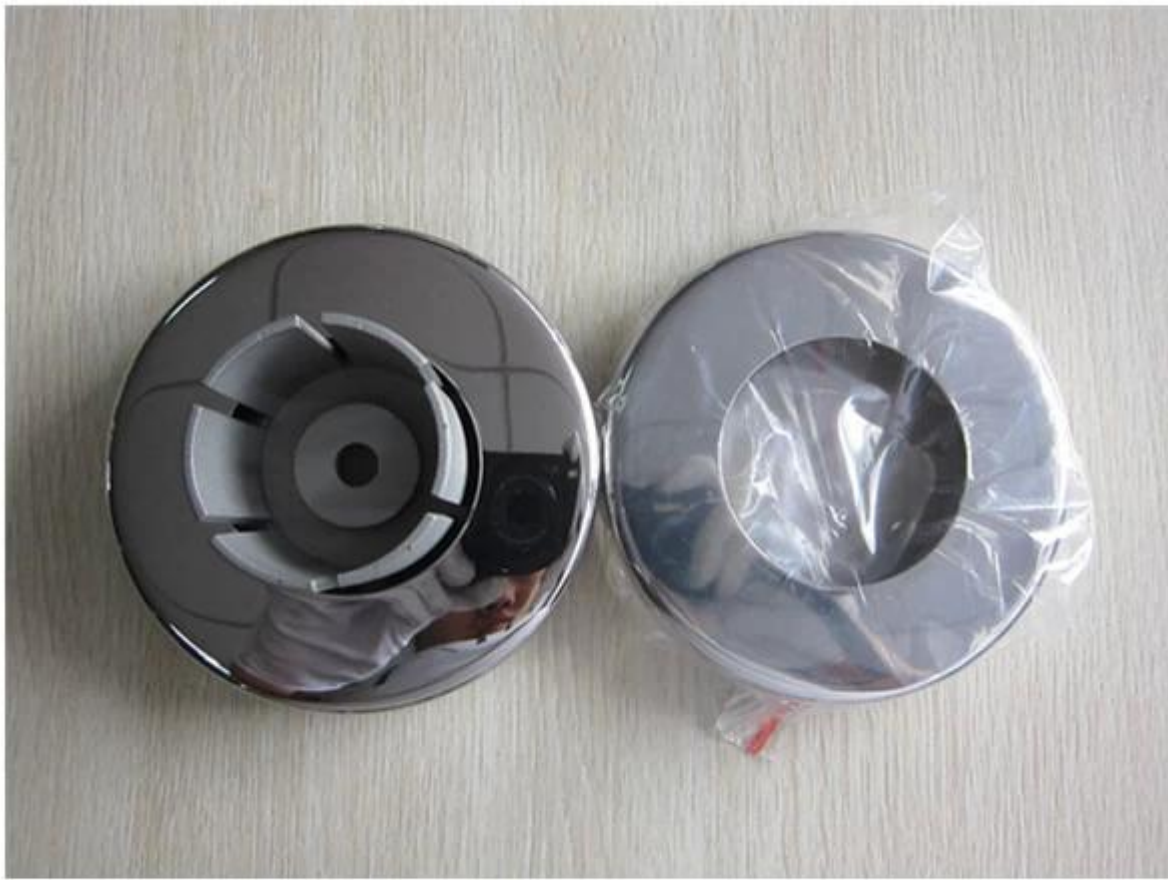
base and cover BS911