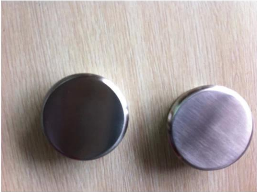
stainless steel end cap