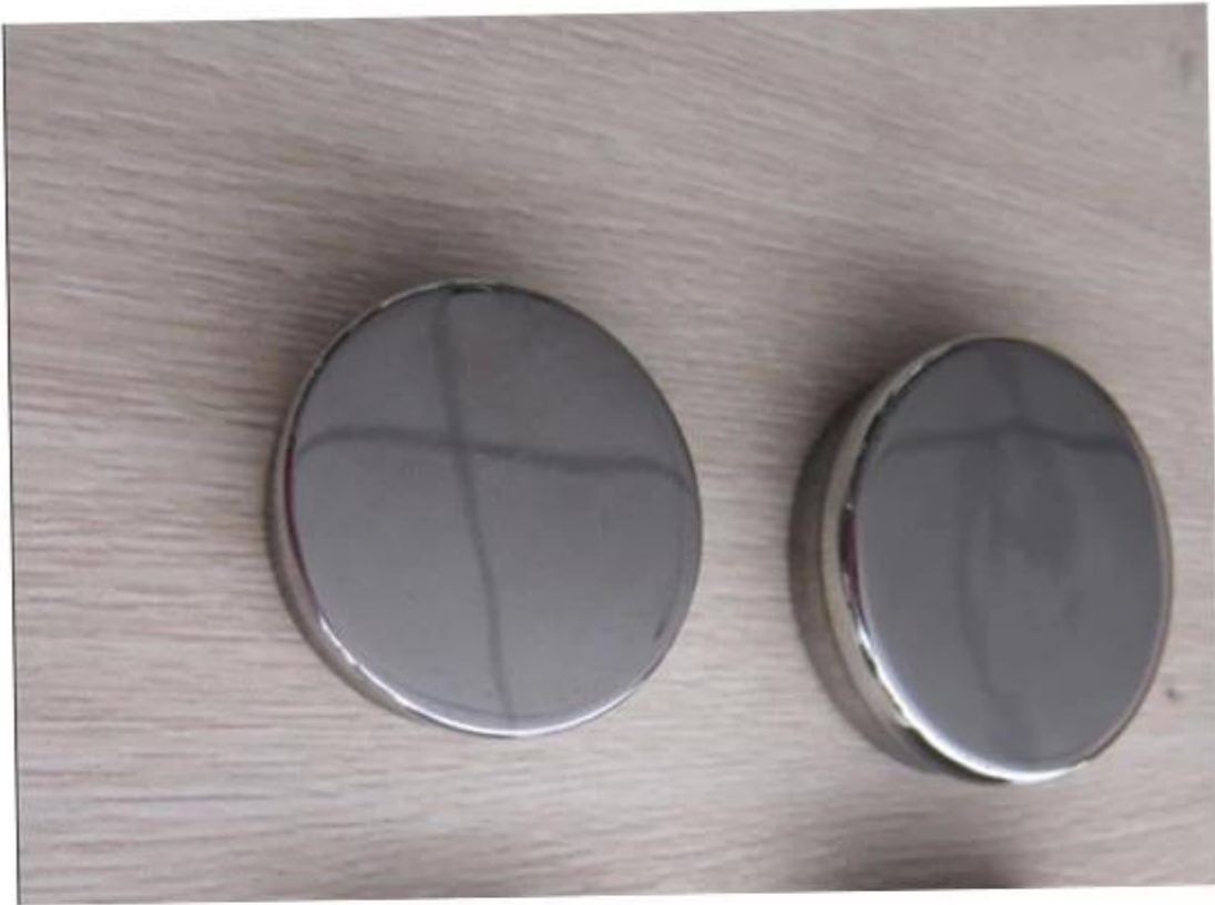
round end cap LCH214