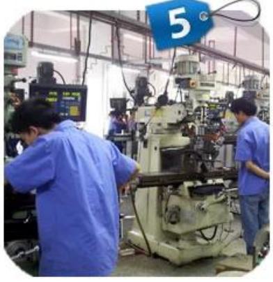
Drilling & Tapping