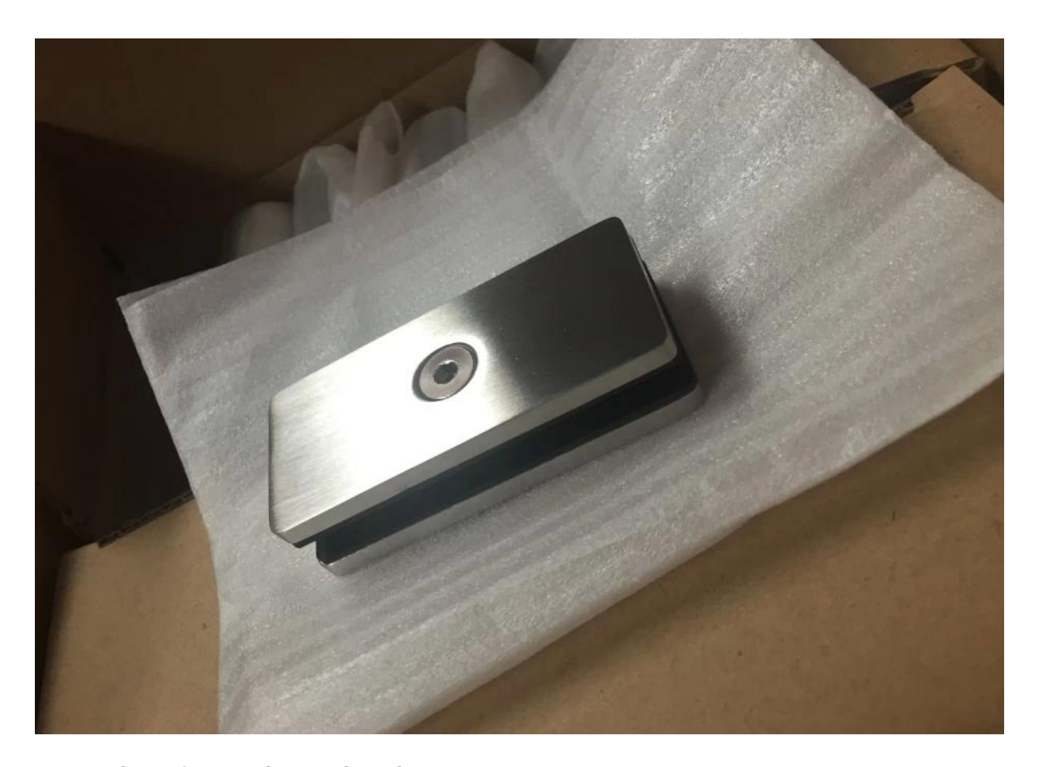
Project photos for 180 degree glass clamp