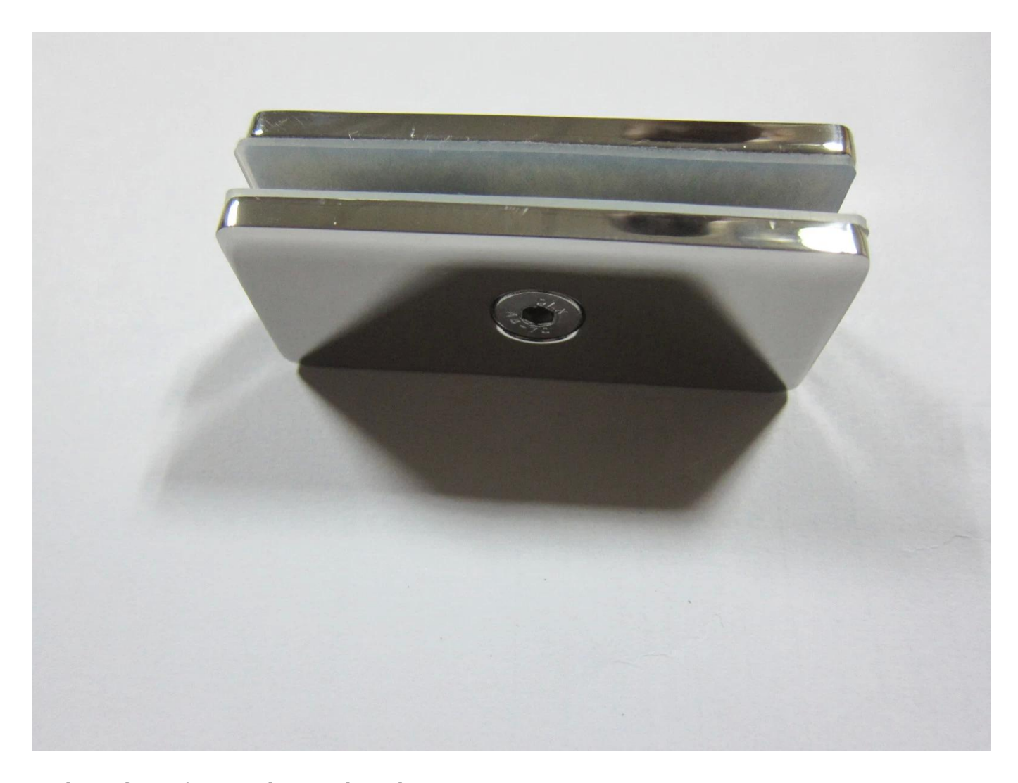
Packing photos for 180 degree glass clamp