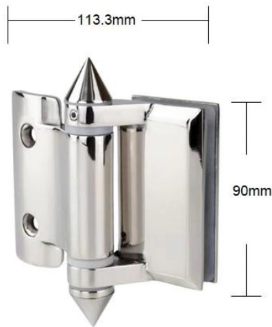
Part # G-R