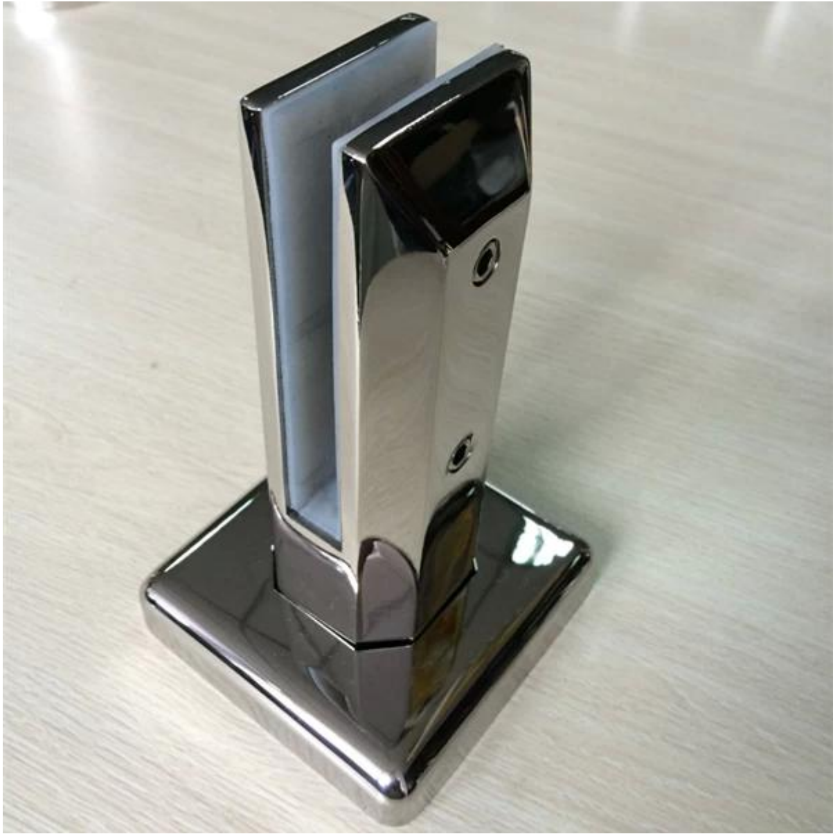
3. stainless steel frameless glass railing spigot project photos,