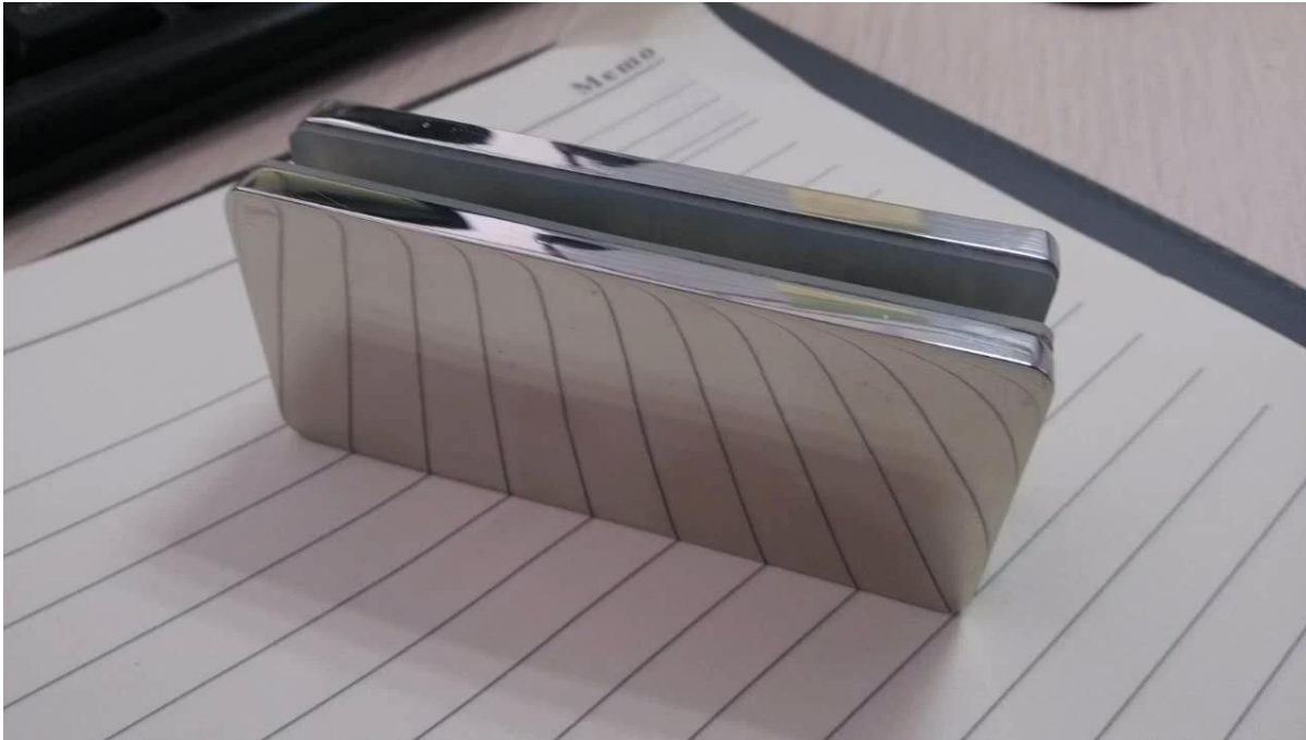
Staircase glass railing with standoff and glass clamp