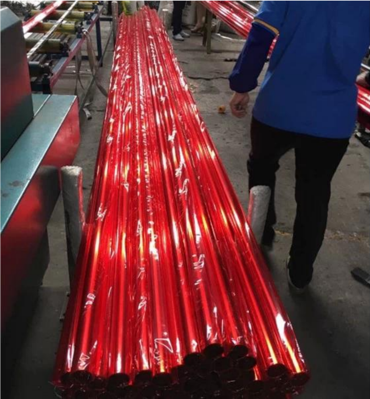
Outer bubble bag film package.