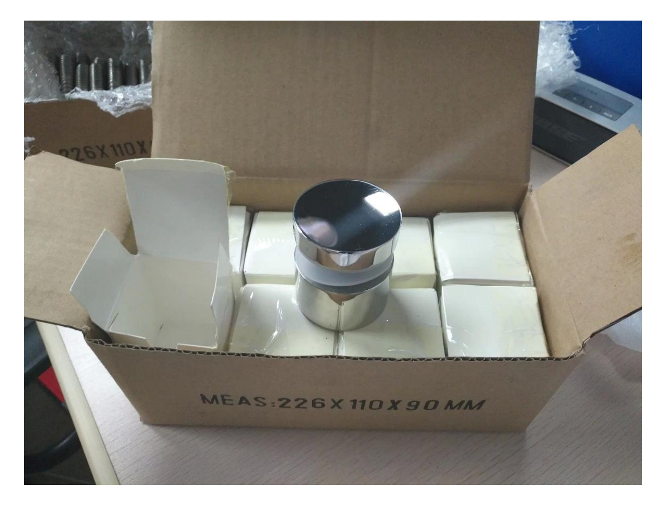
3. 2" stainless steel standoff in frameless glass staircase glass balcony railing project :