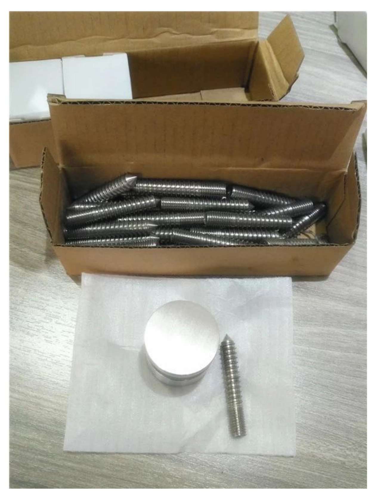
Mirror plished one :