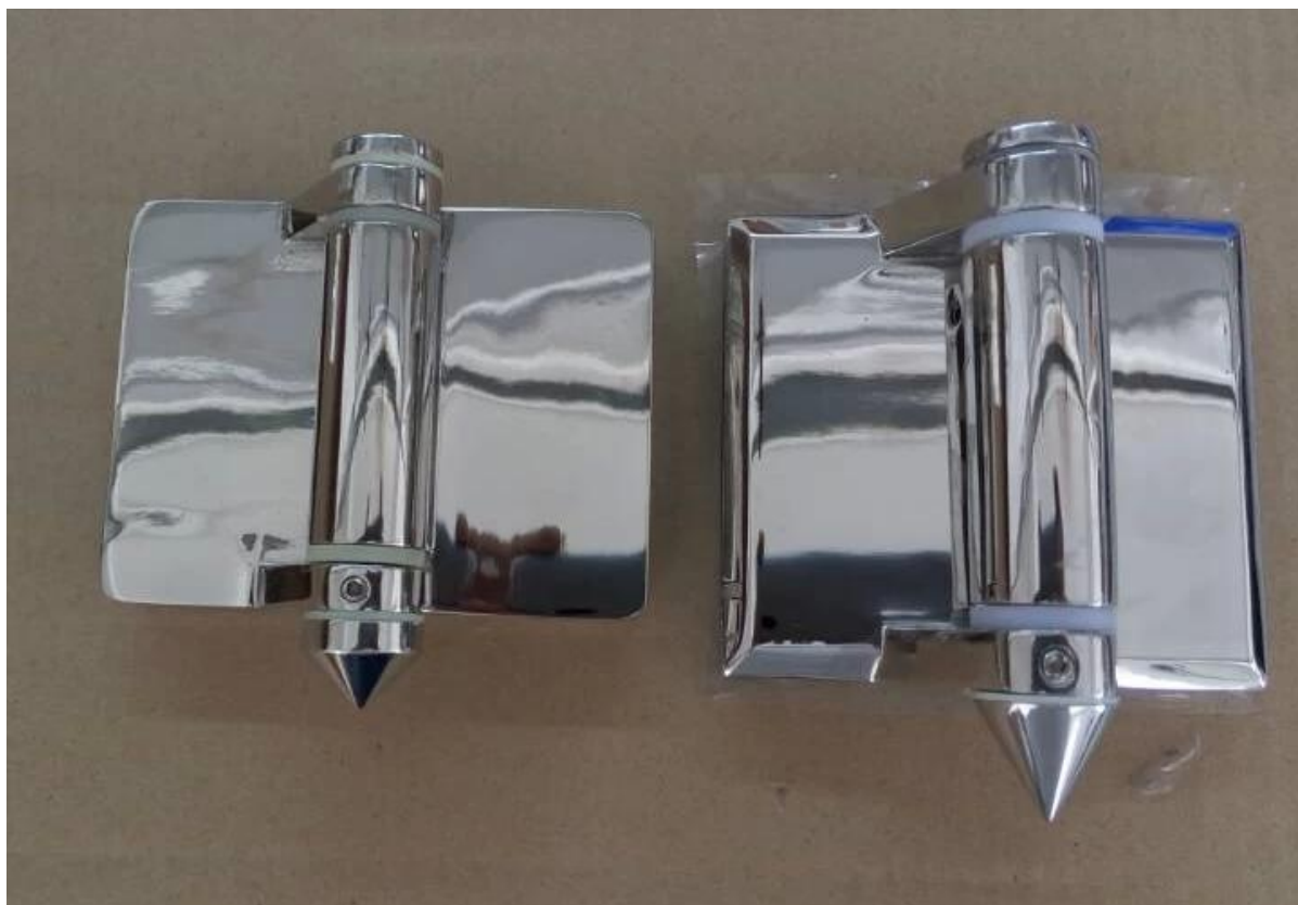
Glass pool fencing Project finished photos for your reference :