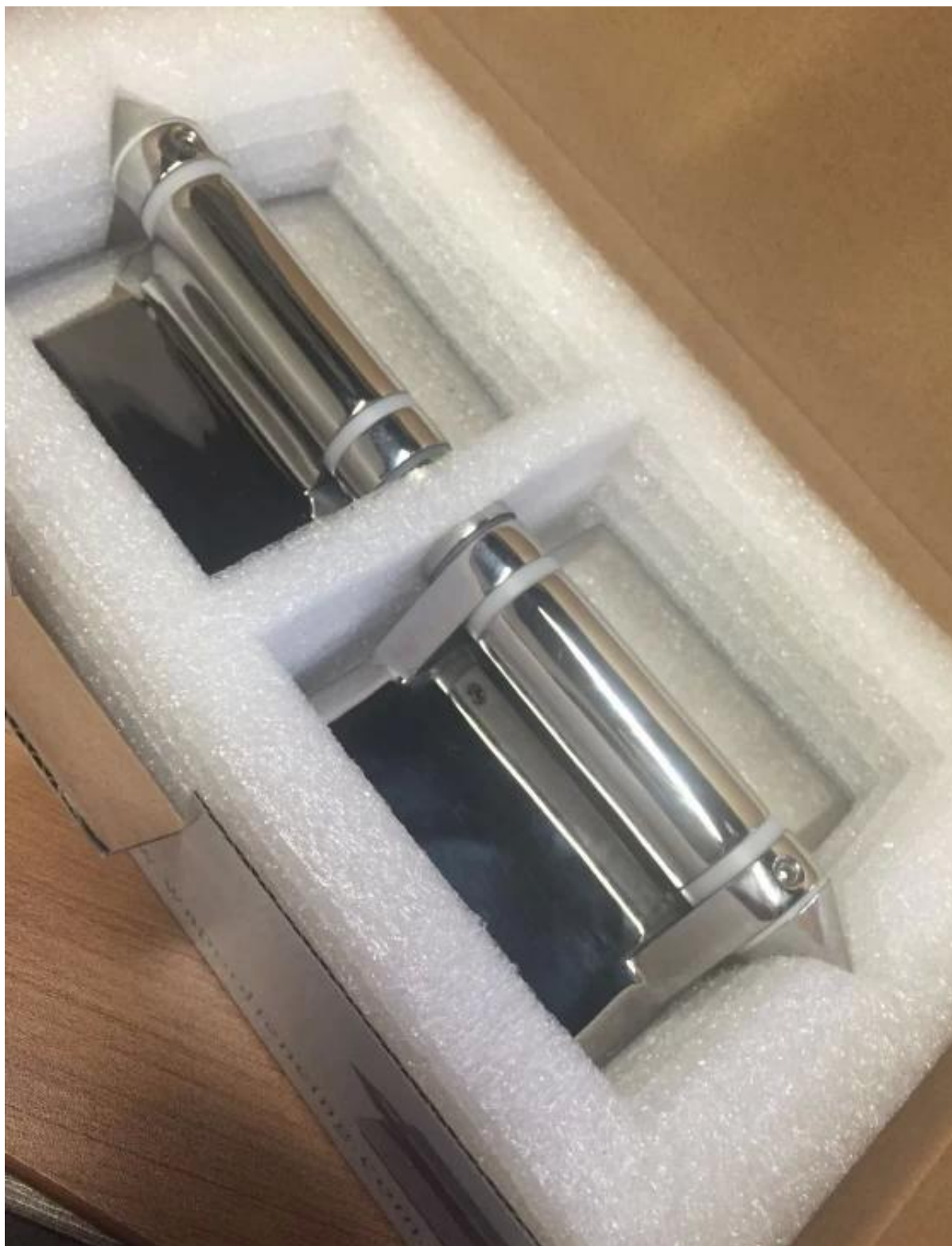
The left is Model No.G-G2 , and the right one is G-G :