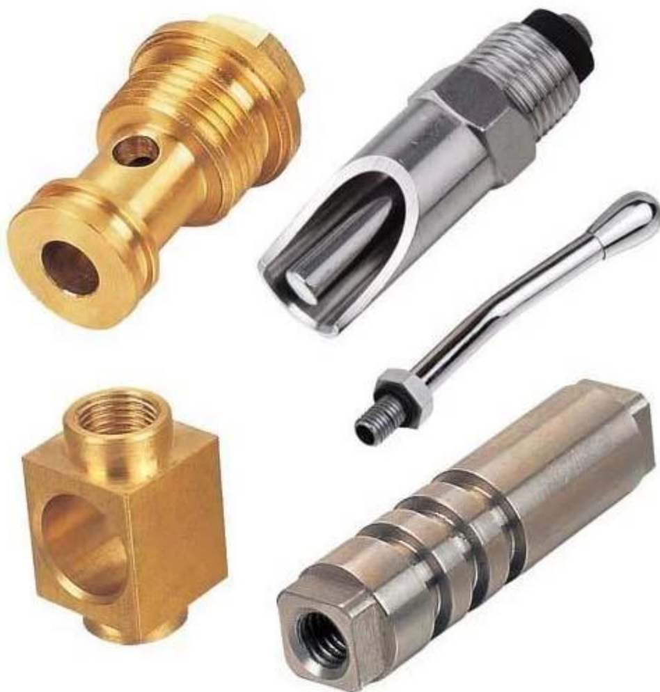
16. Precision machining parts