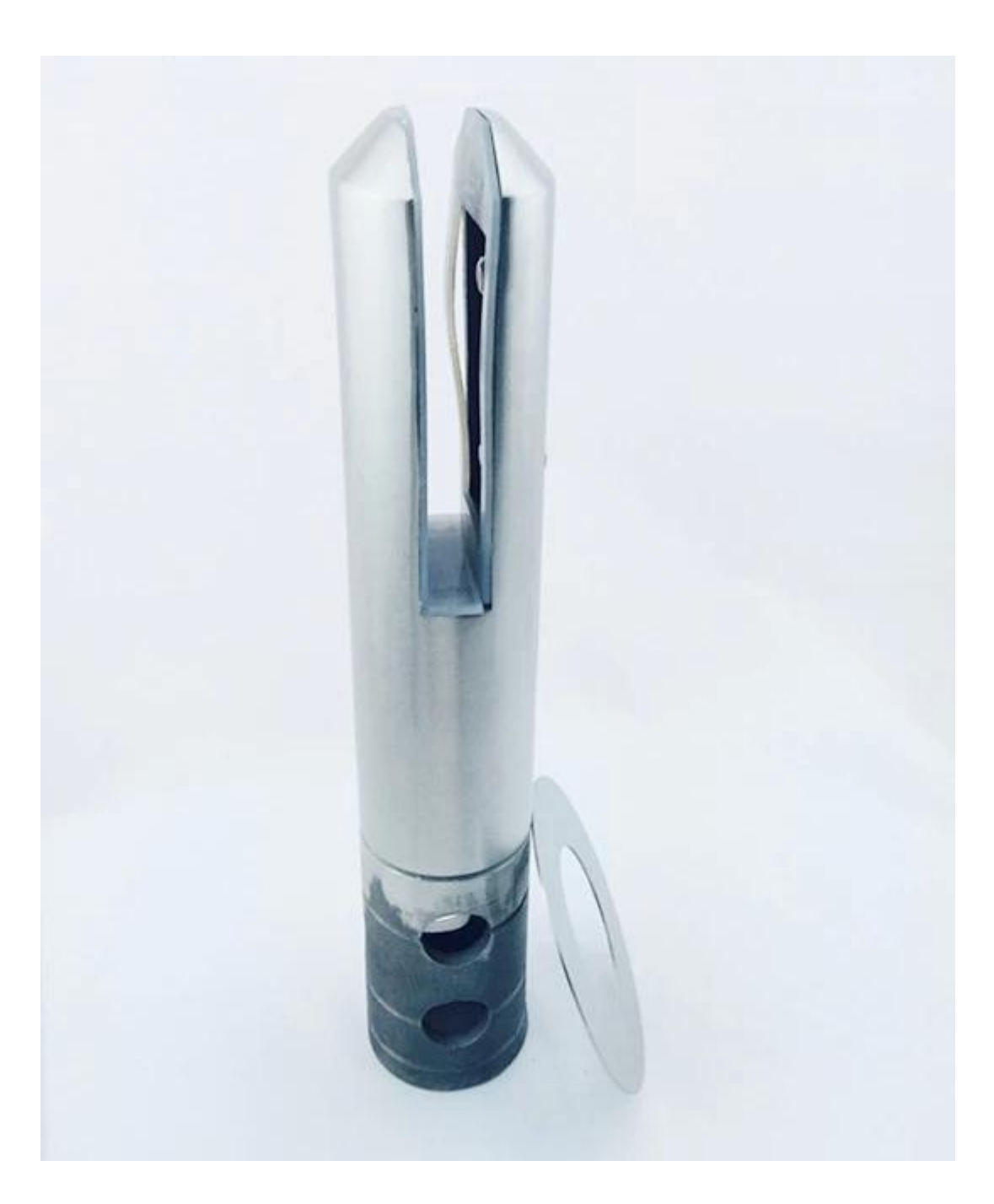
mirror SBM-2 project show