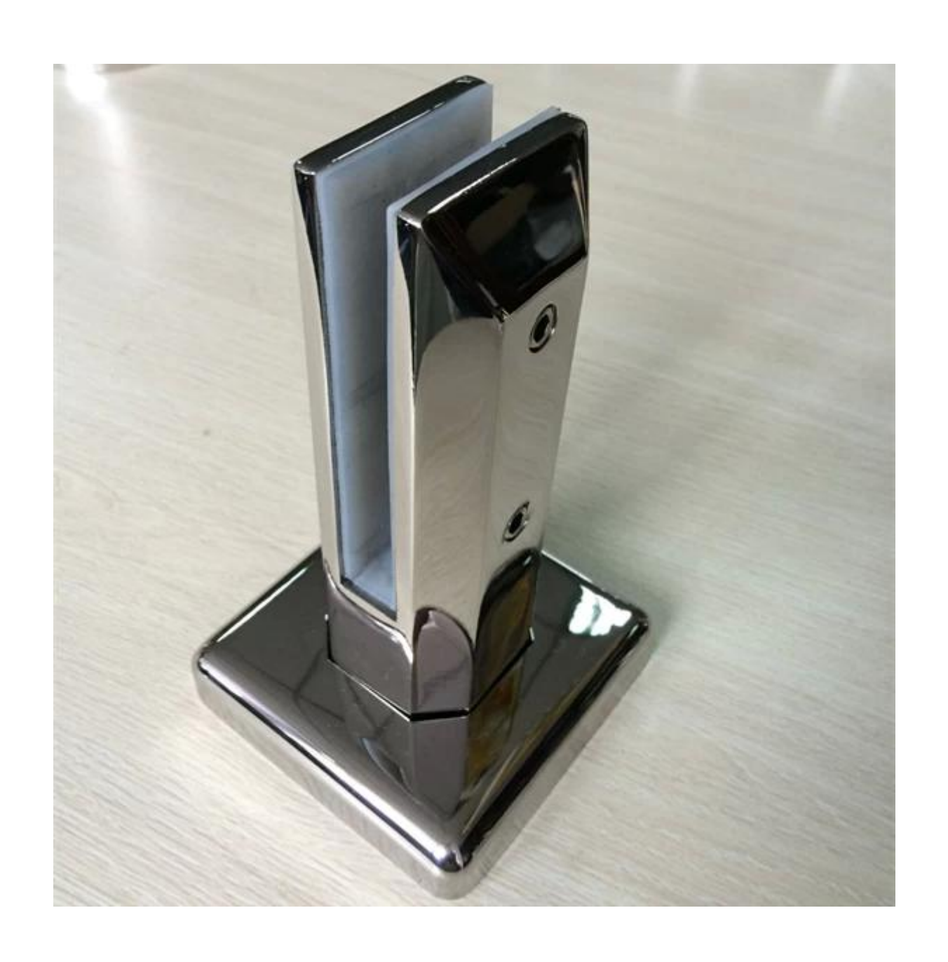
Model No.: SCM-2 (square coer drill spigot)