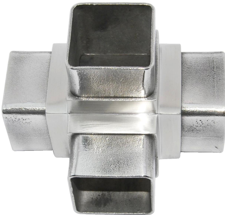
4 way square connectorS405