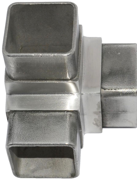
3 way corner square connectorS403