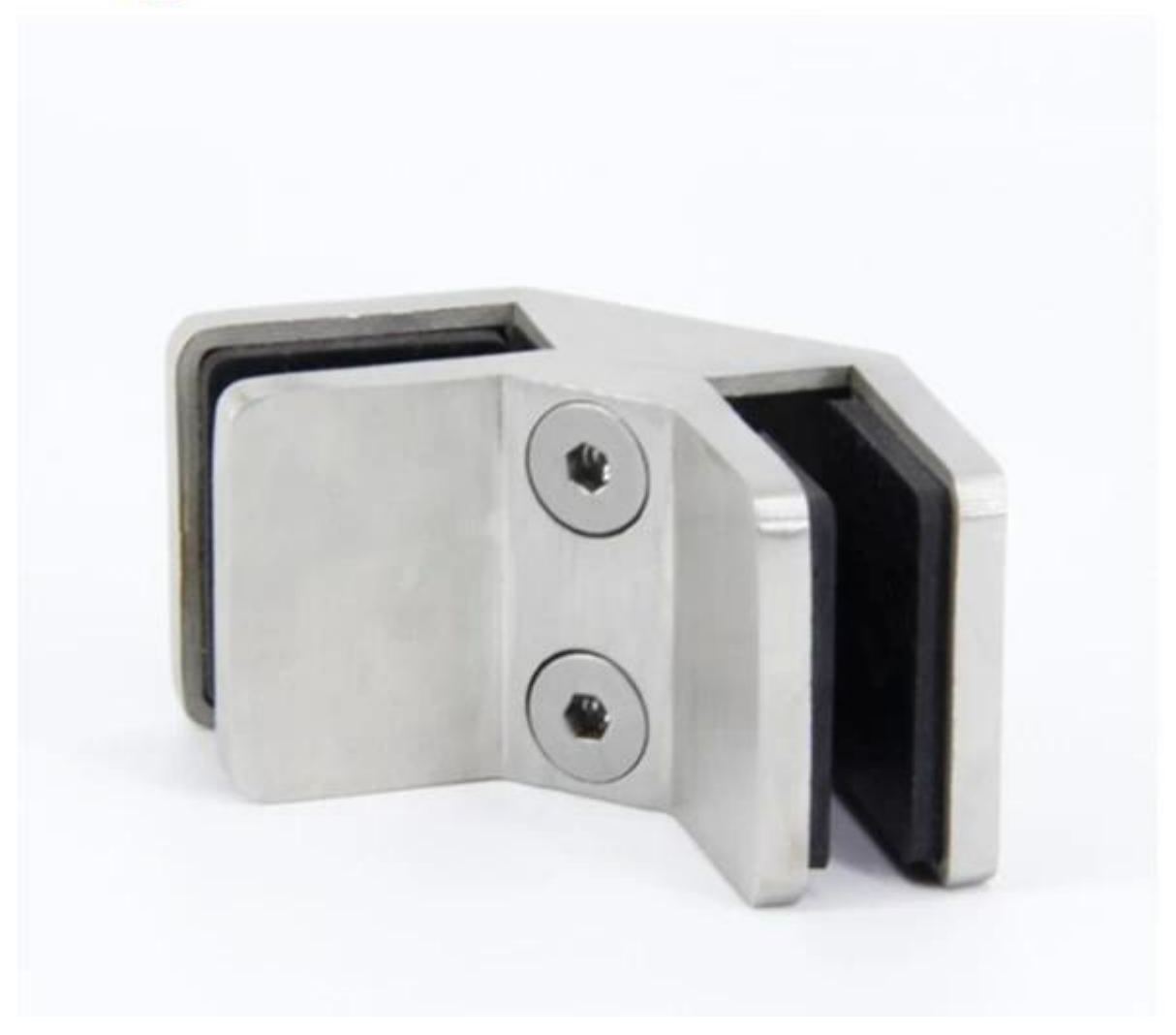
Project installed with that PV-90 glass clamp :