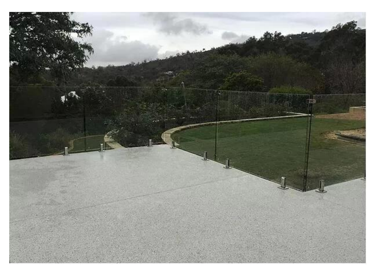
For Middle 180 degree glass clamp \mathbf{Model} \mathbf{No.} \mathbf{BC-80} \mathbf{x} \mathbf{35} also available :