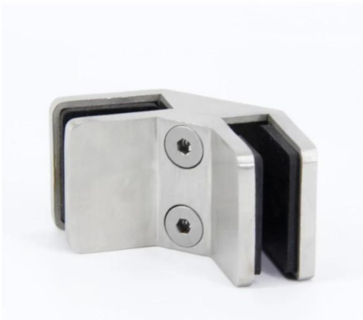
Project installed with that PV-90 glass clamp :