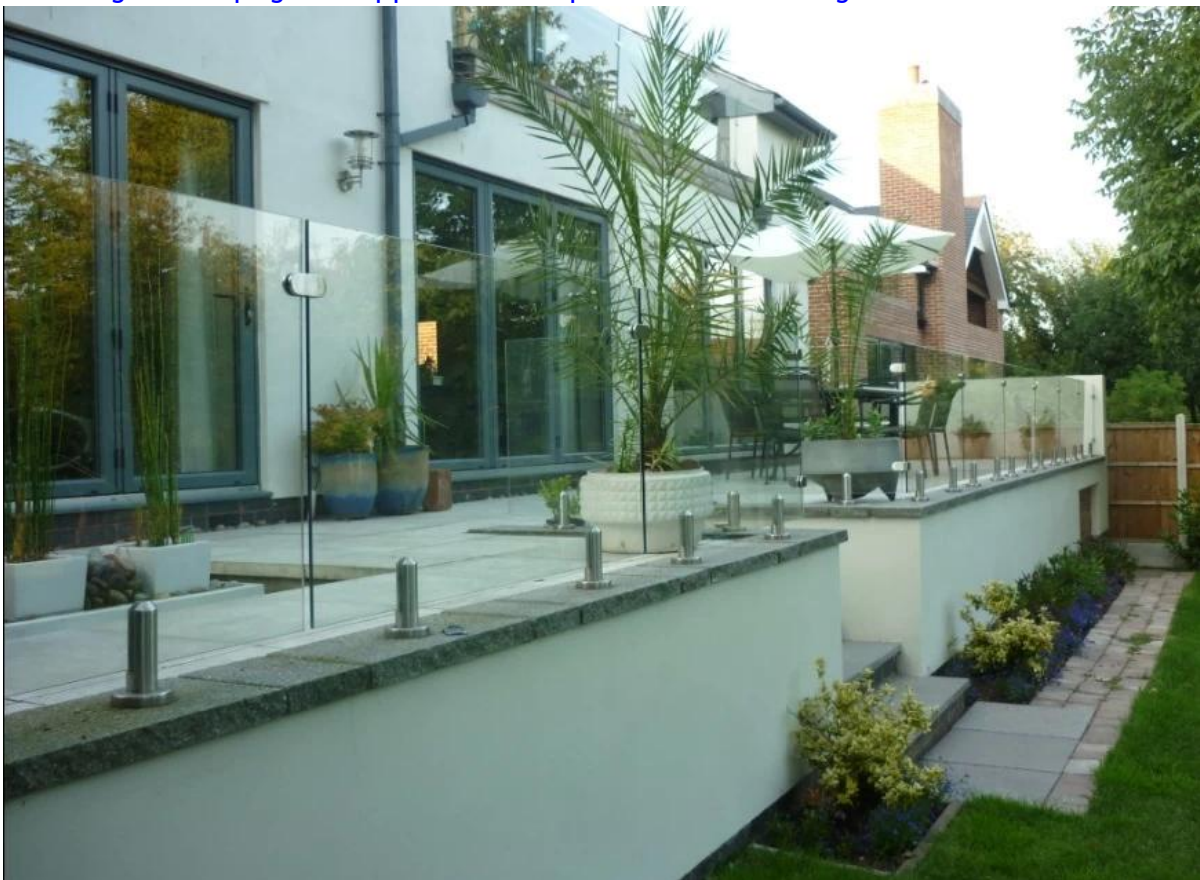
frameless glass balustrade for balcony design, tempered glass railing system for pool fence