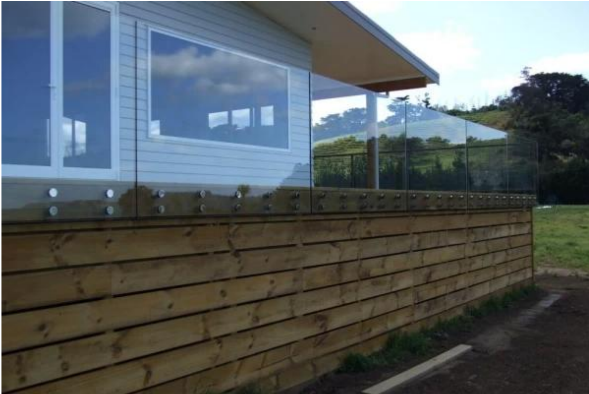
glass balustrade with spigot stainless steel glass spigot factory for balcony design, stainless steel core drill glass spigot supplier for pool fence design