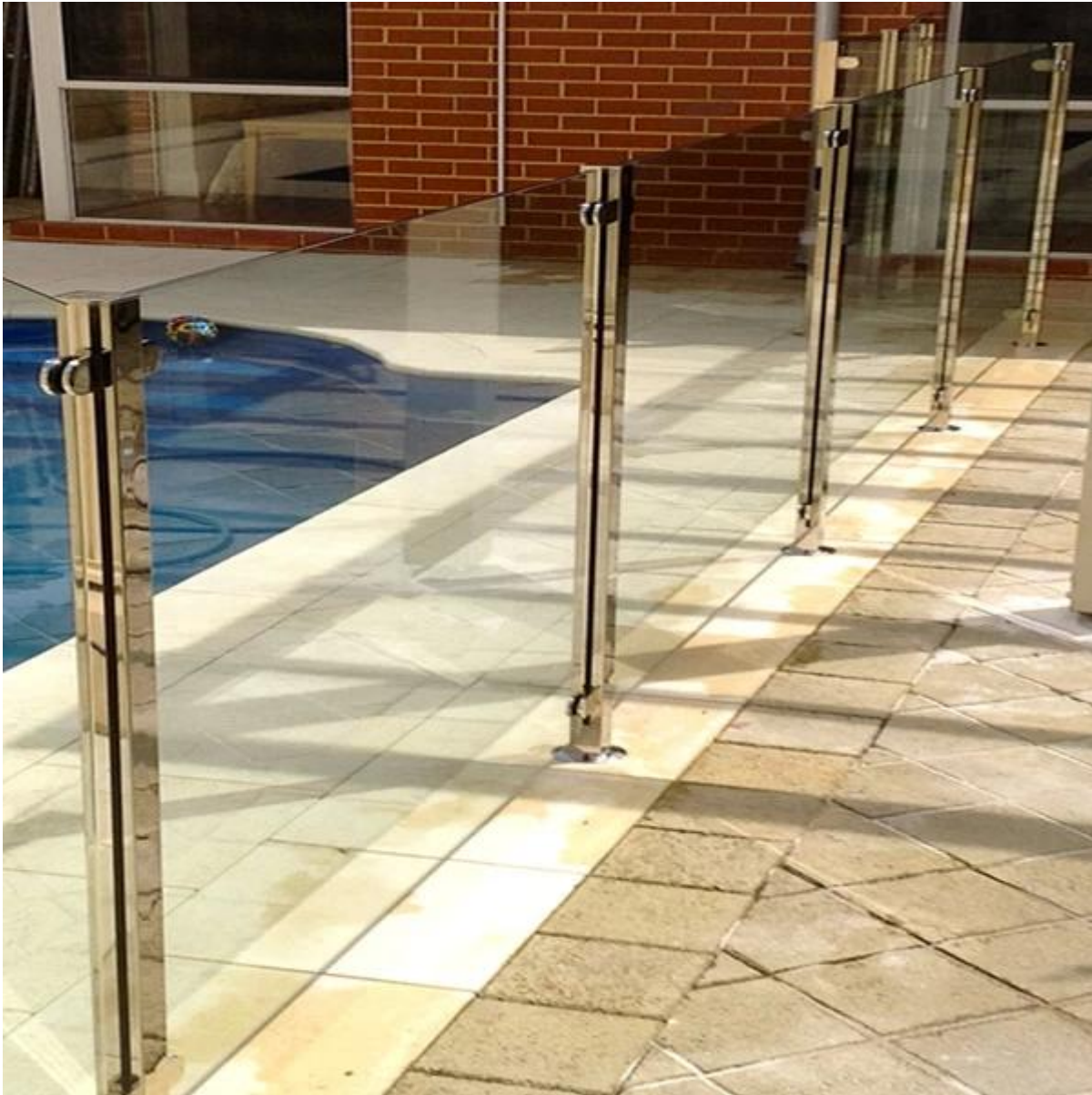
stainless steel glass balustrade post for stair design, stainless steel railing system for balcony design