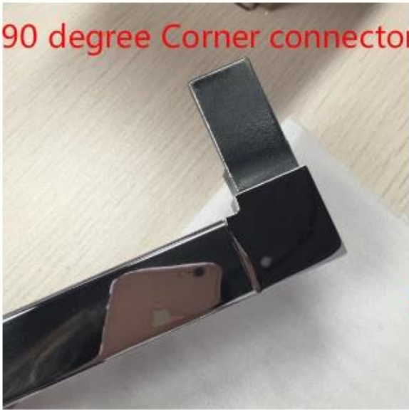
90 degree Corner connector