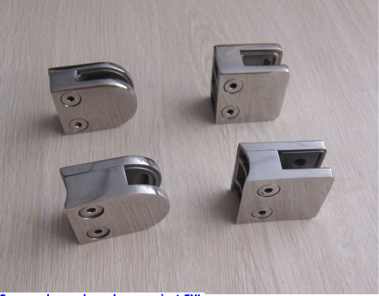
Square shape glass clamp project FYI: