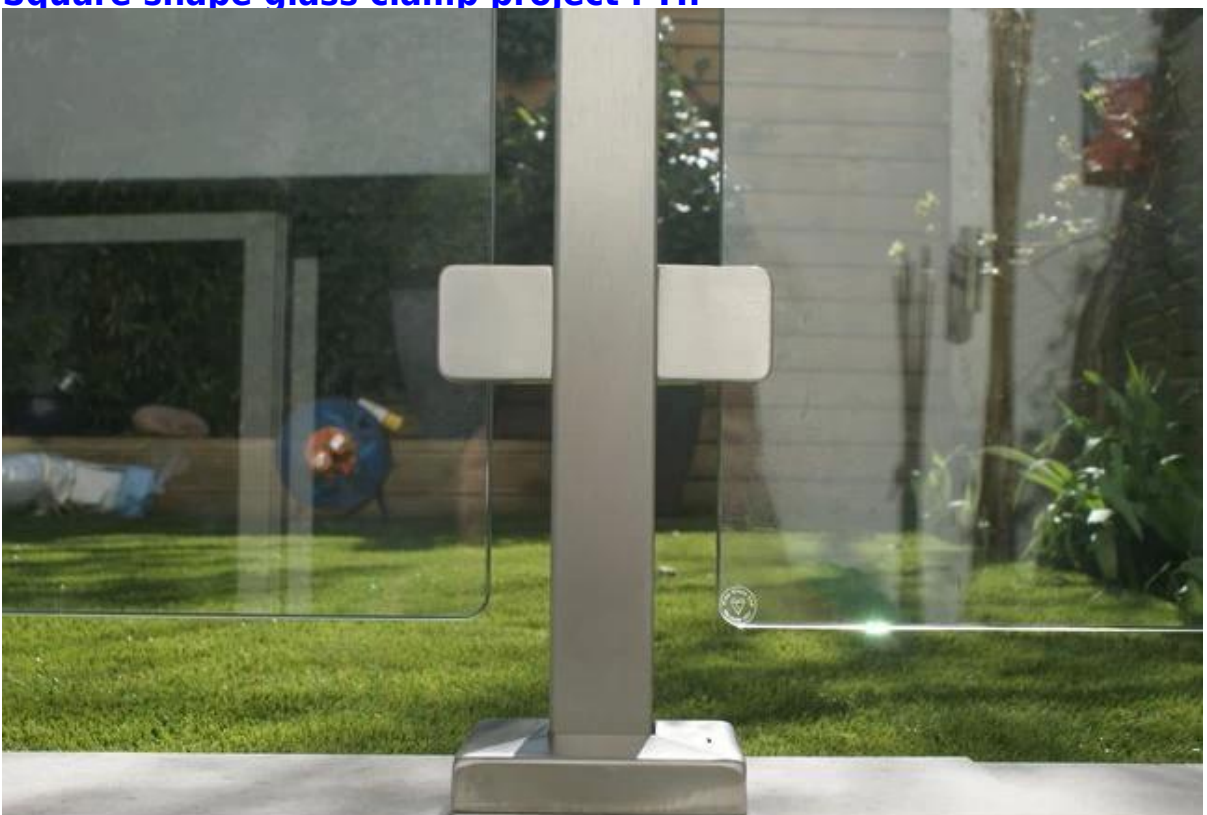
Thanks for your visit, Any interested or needs, please kindly contact with me freely : Contact: Joey Lan