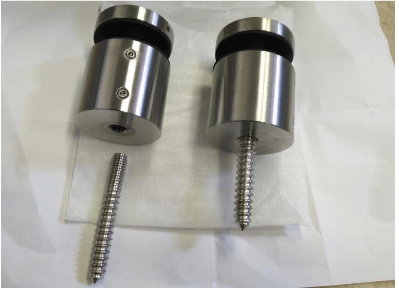
Other models of glass standoffs with different sizes-