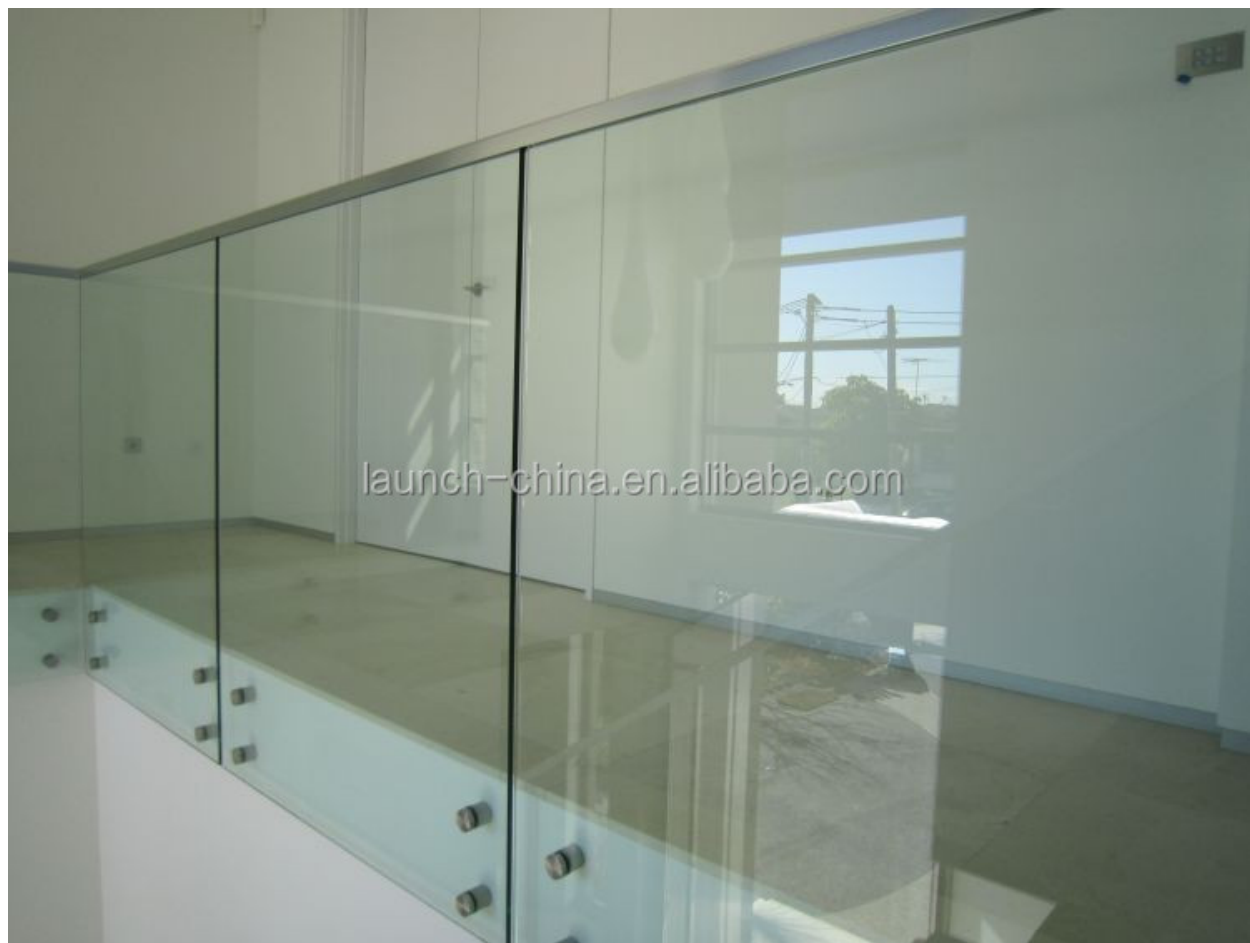
2.Out door deck