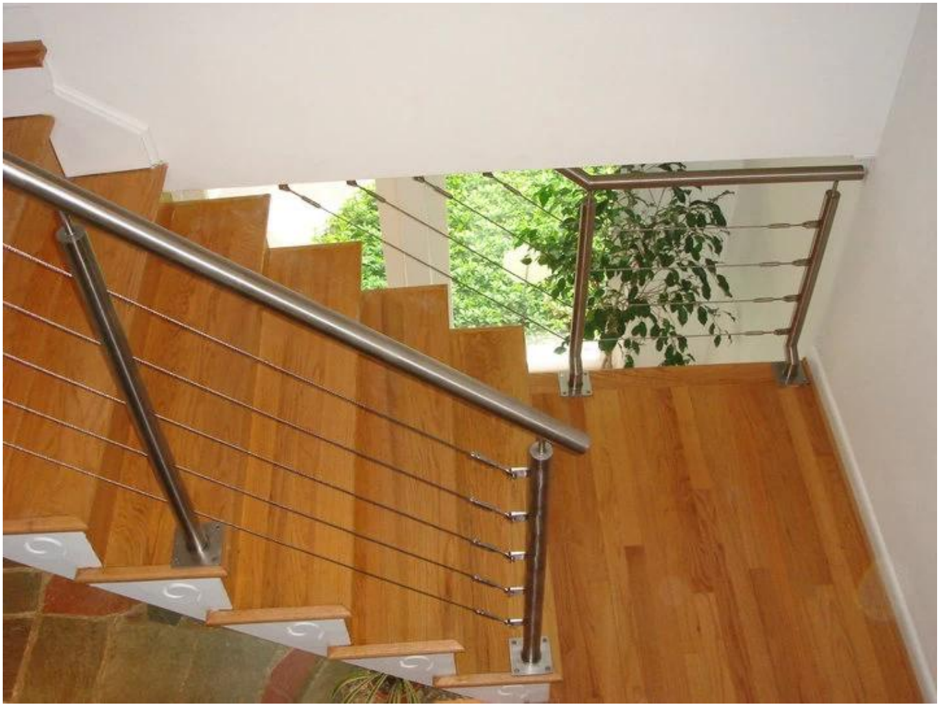
stainless steel stair cable railing posts -