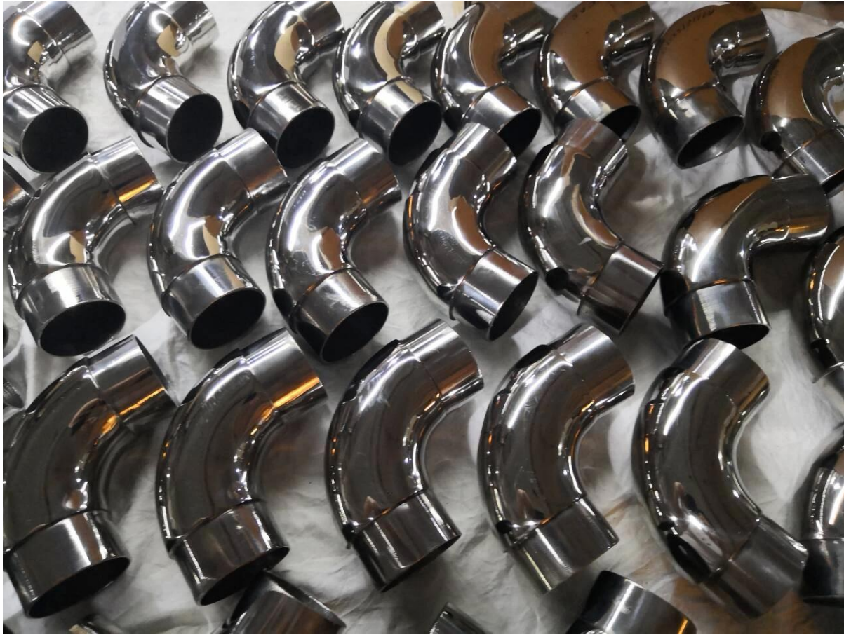
straight corner 90 degree handrail elbow-