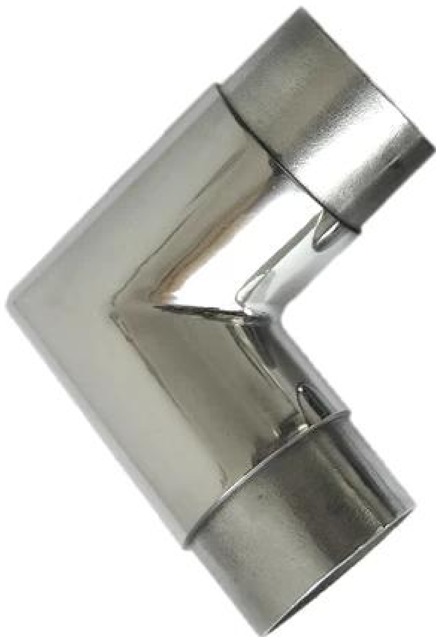
Ajustable handrail elbows for 42.4/50.8mm tube-