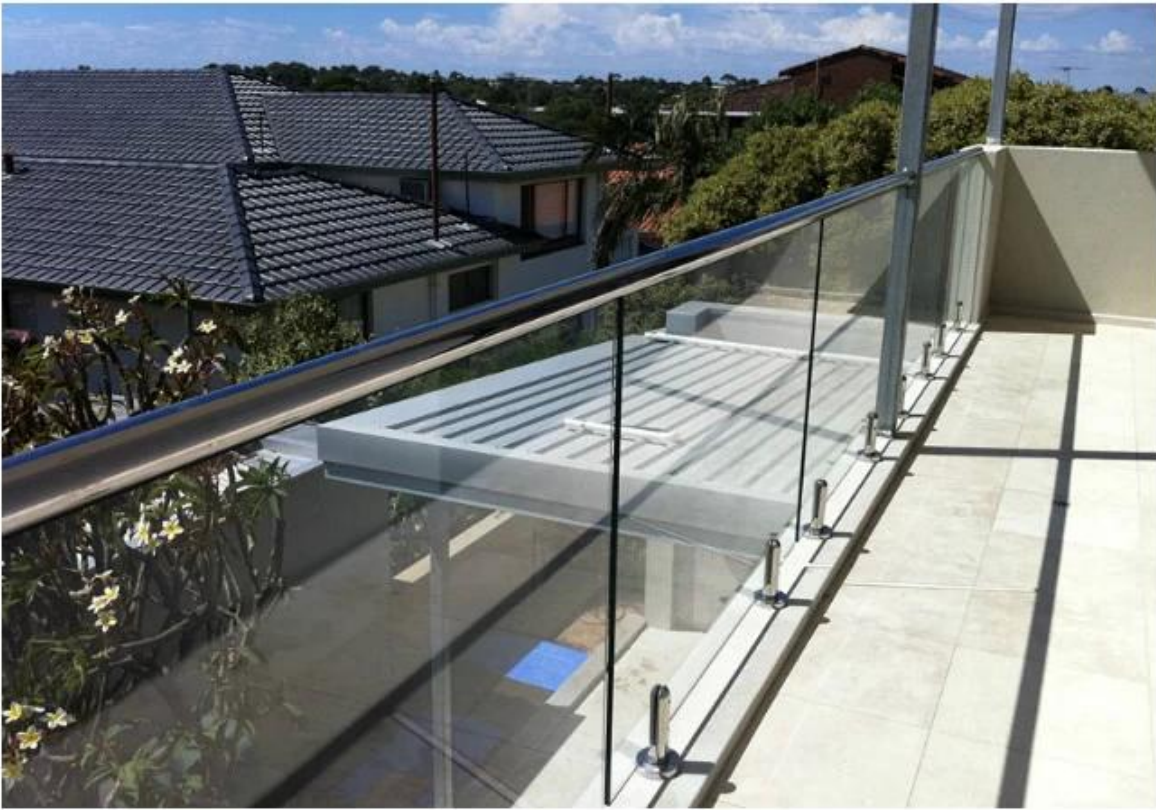
2. stainless steel spigot for swimming pool design: