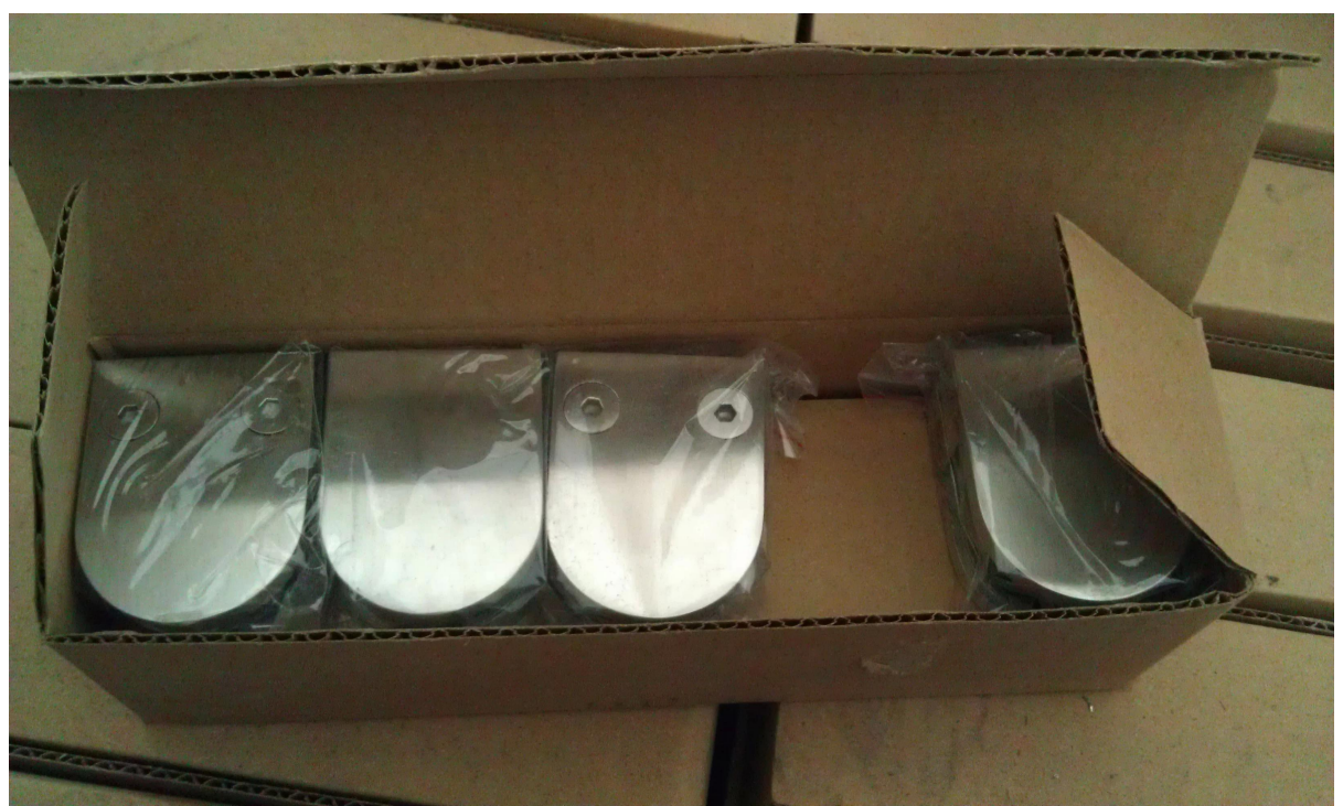
for installation photo, please check here: