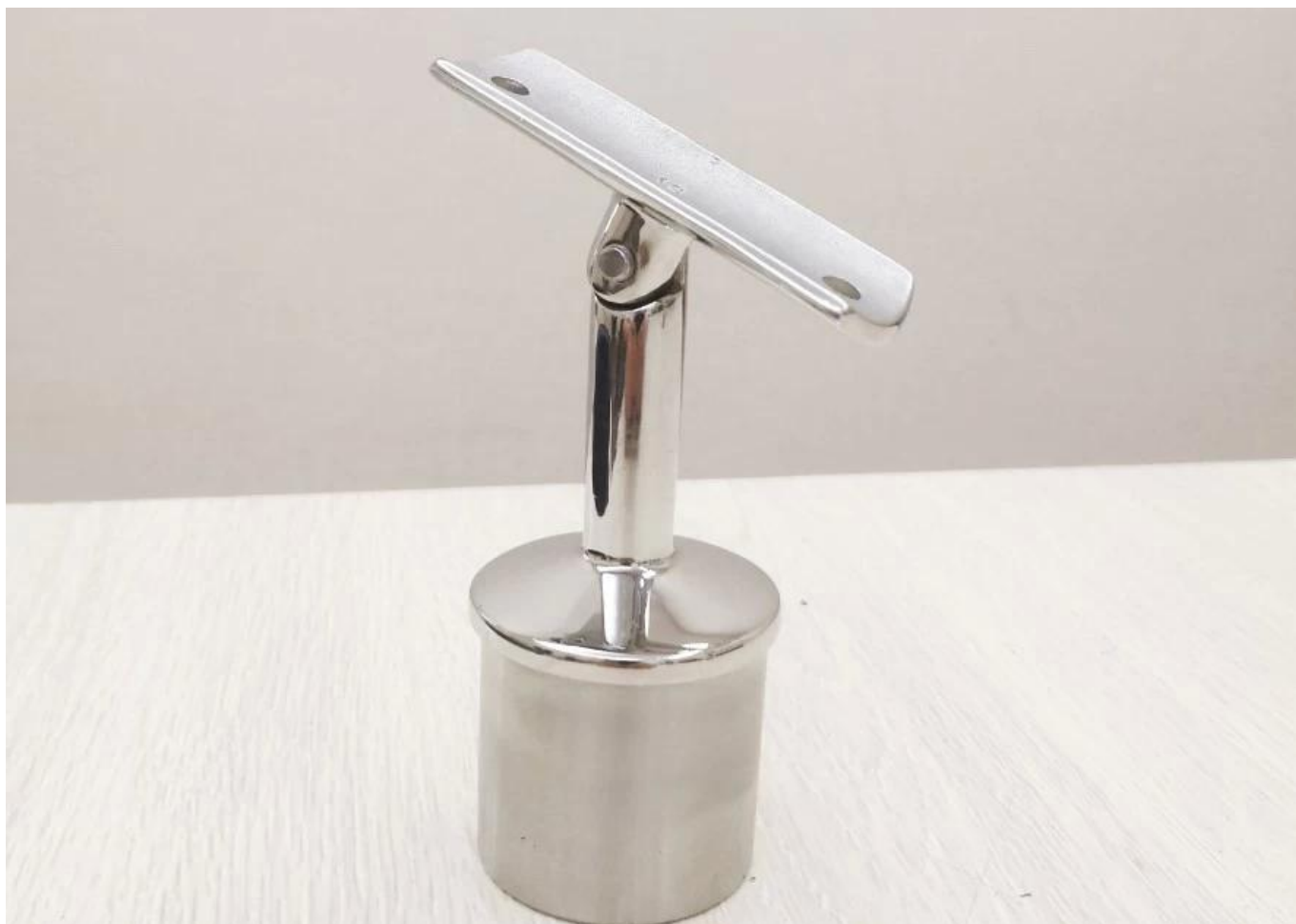
# Fotos de instalação de aço inoxidável suporte pós corrimão