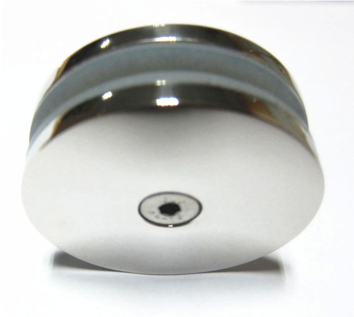
3. foto do projeto de vidro para braçadeira de vidro