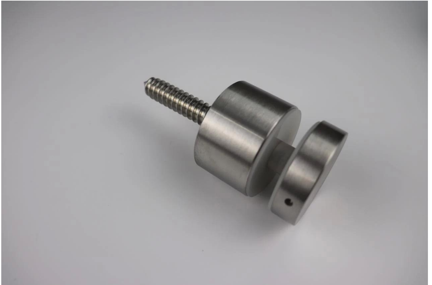
# Drawing for glass frameless standoff clamp hardware Standoff with concrete bolt, # SF-50