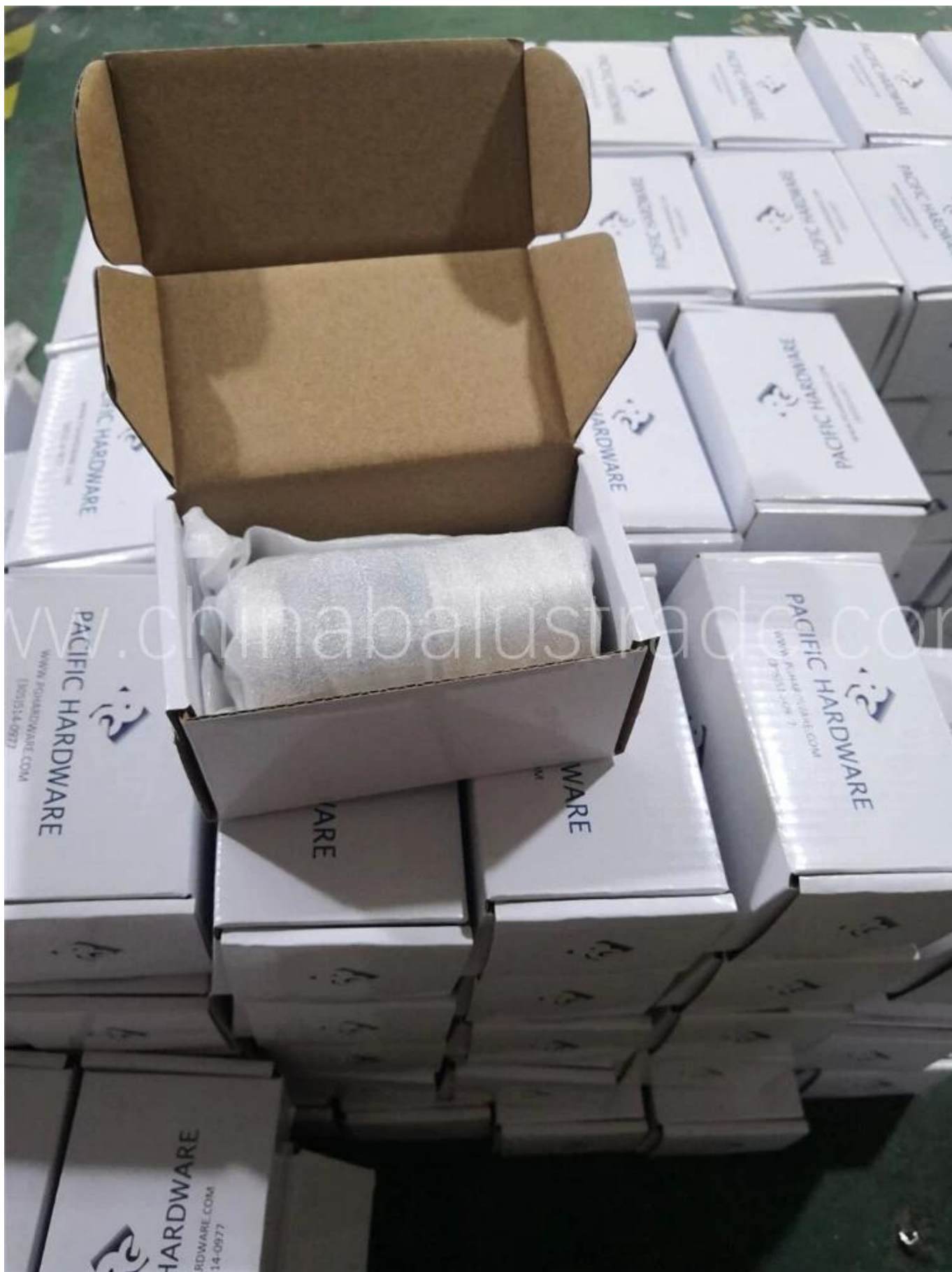
Проектные фотографии из матовой нержавеющей стали CRL стеклянные рельсовые фитинги