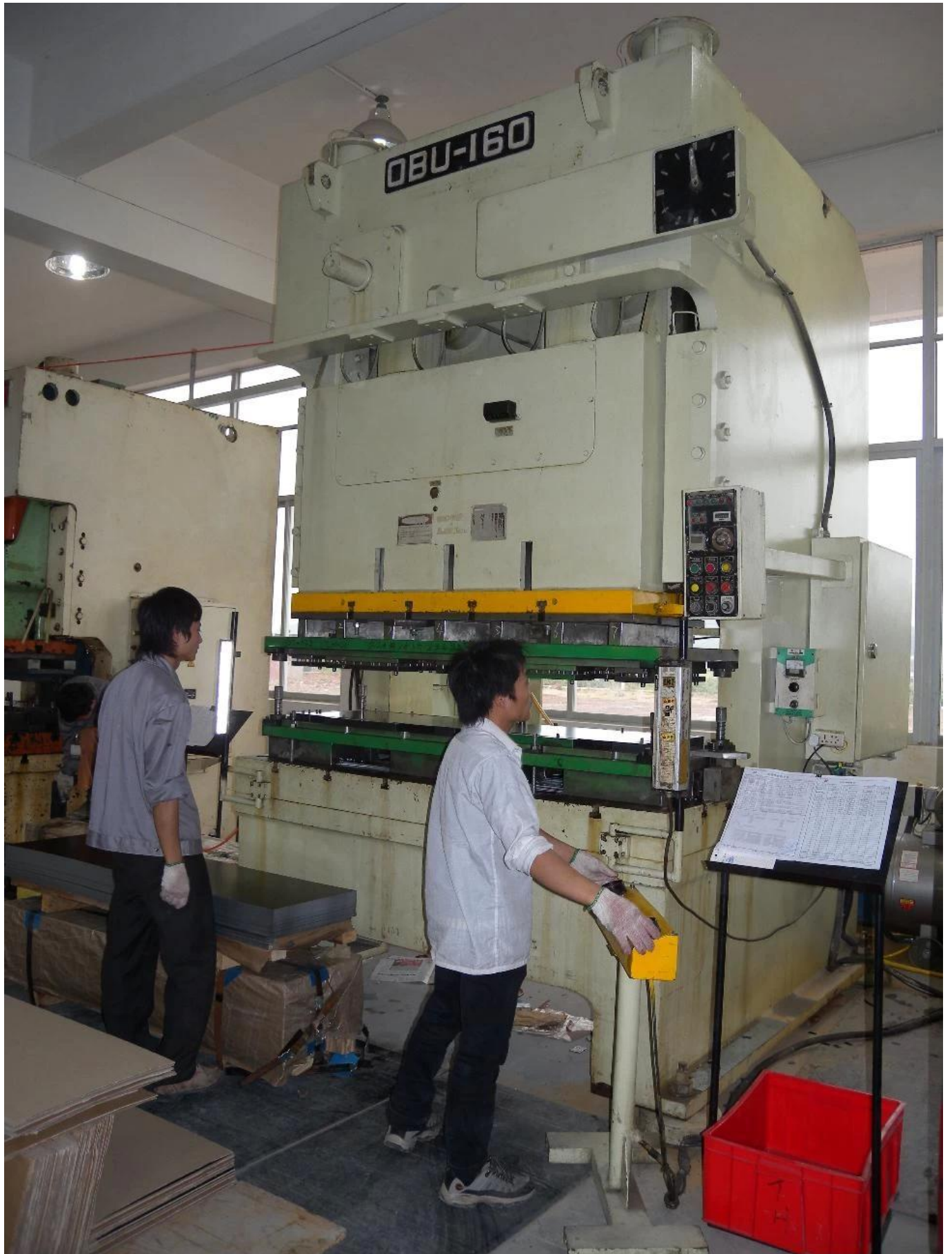
160T 宽台面冲床 模具加工尺寸800*1800mm