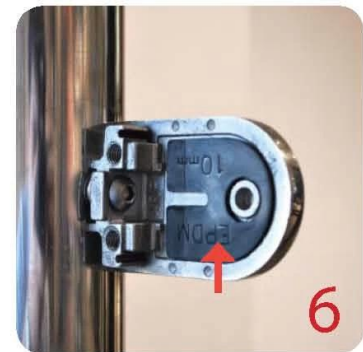
Select appropriate rubber gasket to suit glass panel thickness. Install rubber gasket into both sides of glass clamp. (Note rubber gasket marked with sizes).