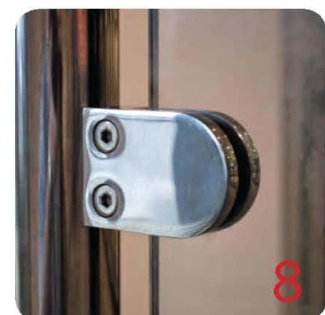
Tighten glass clamps with hex key, and check glass panel are secure with no movement.