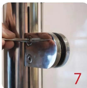
Fit glass panel into position, install second half of glass clamp secure with provided hex screws.