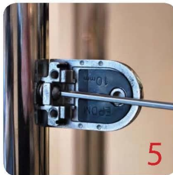
Align half glass clamp with blind rivet nut inline position. Screw in button head cap screw into thread and tighten with hex key.