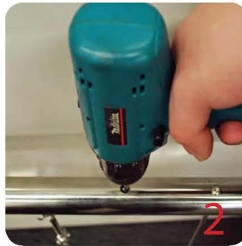
Drill centre punched hole in tube to suit blind rivet nut.