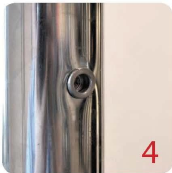
Check installed blind rivet nut is secure and ready for install.