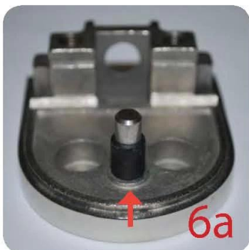
If heavier clamping load is required please use supplied glass clamp pin, during the install process. Note glass panels will require drilling in order to fit glass clamp pins.