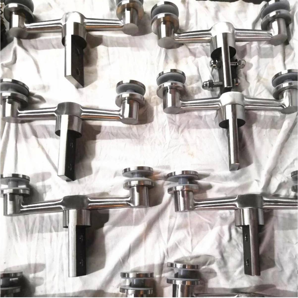
- صورة مشروع زجاج العنكبوت المناسب للجدران الساترة