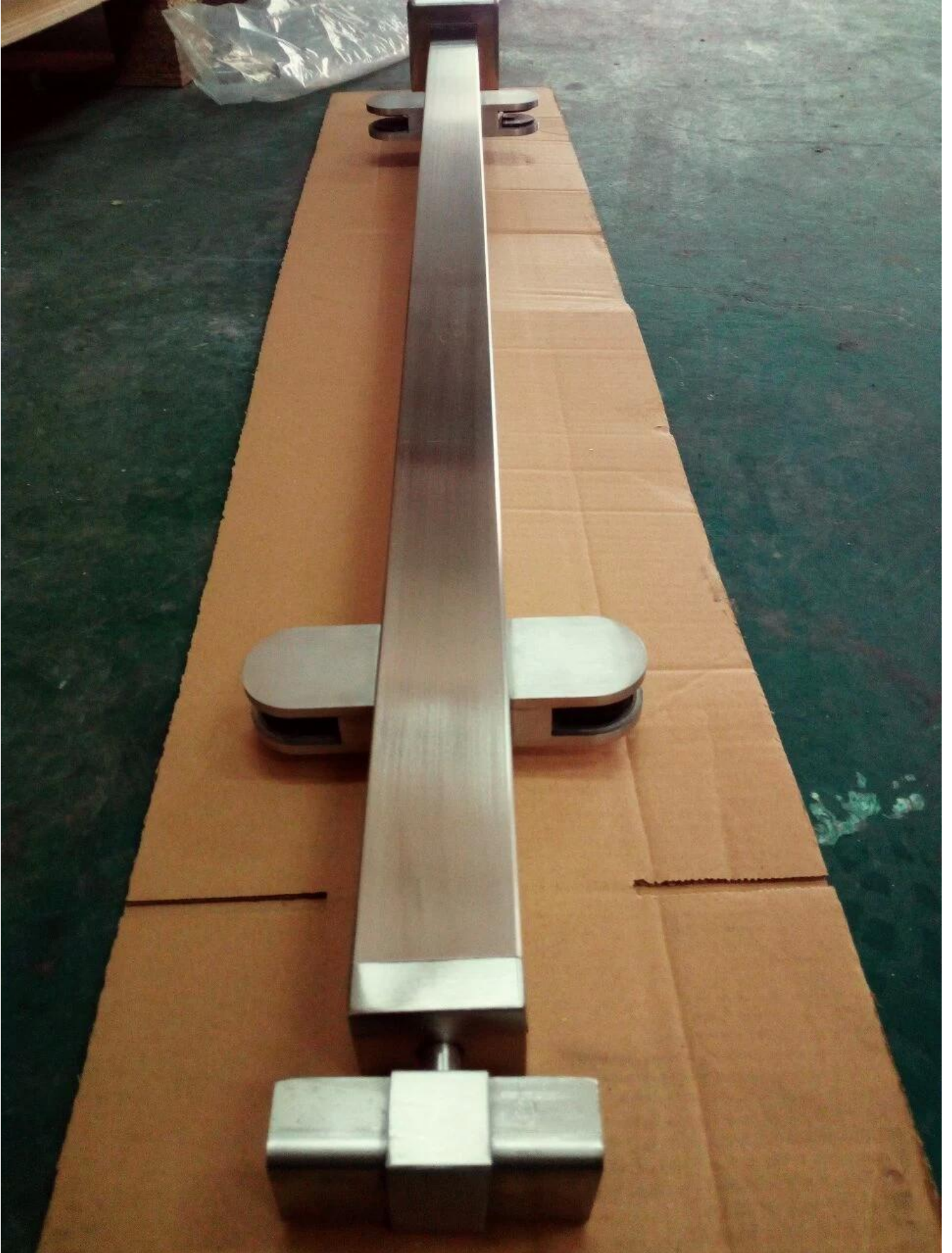
مربع الزجاج حديدي آخر