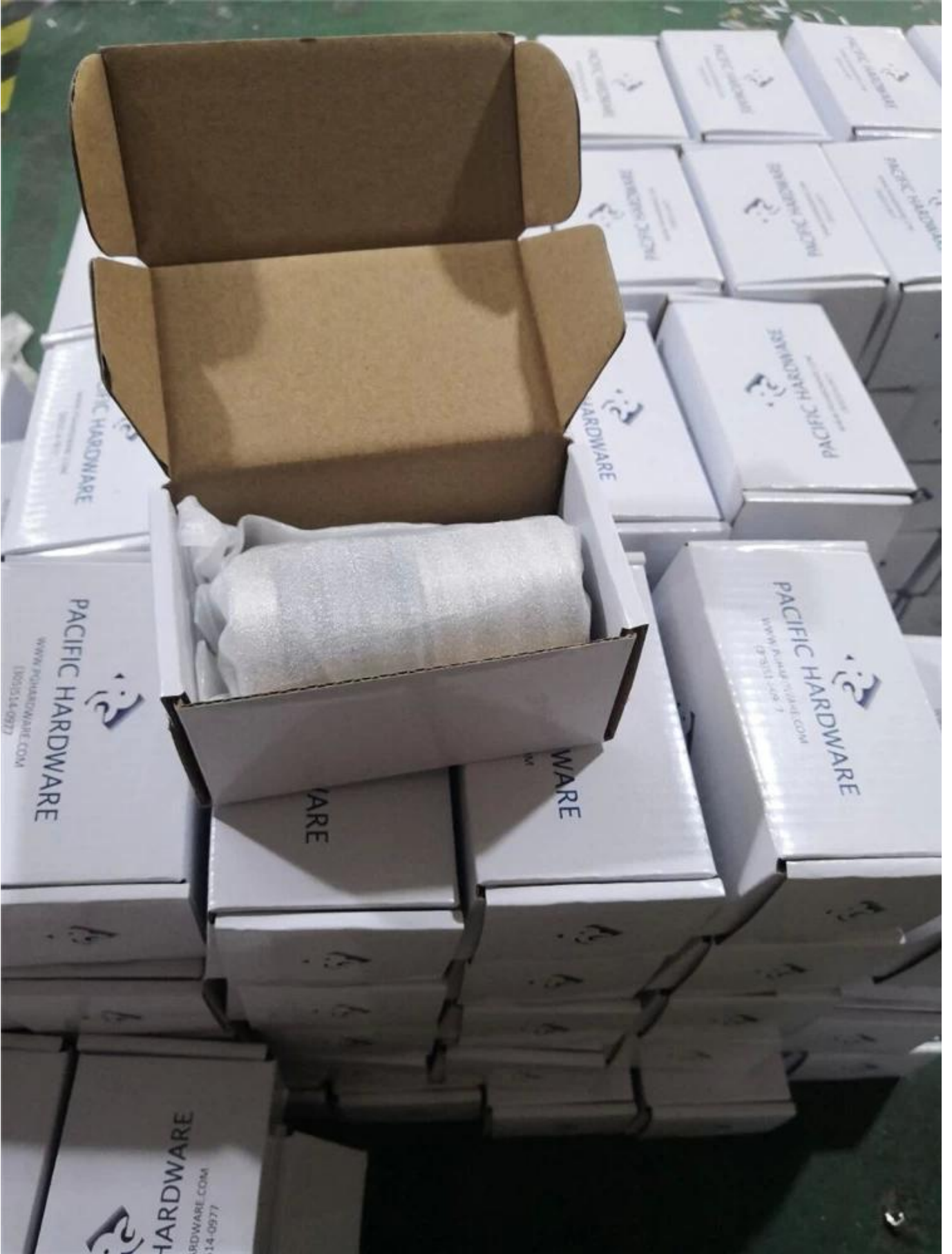
مشروع الصور من الفولاذ المقاوم للصدأ الزجاج المواجهة الزجاج شرفة تصميم حديدي