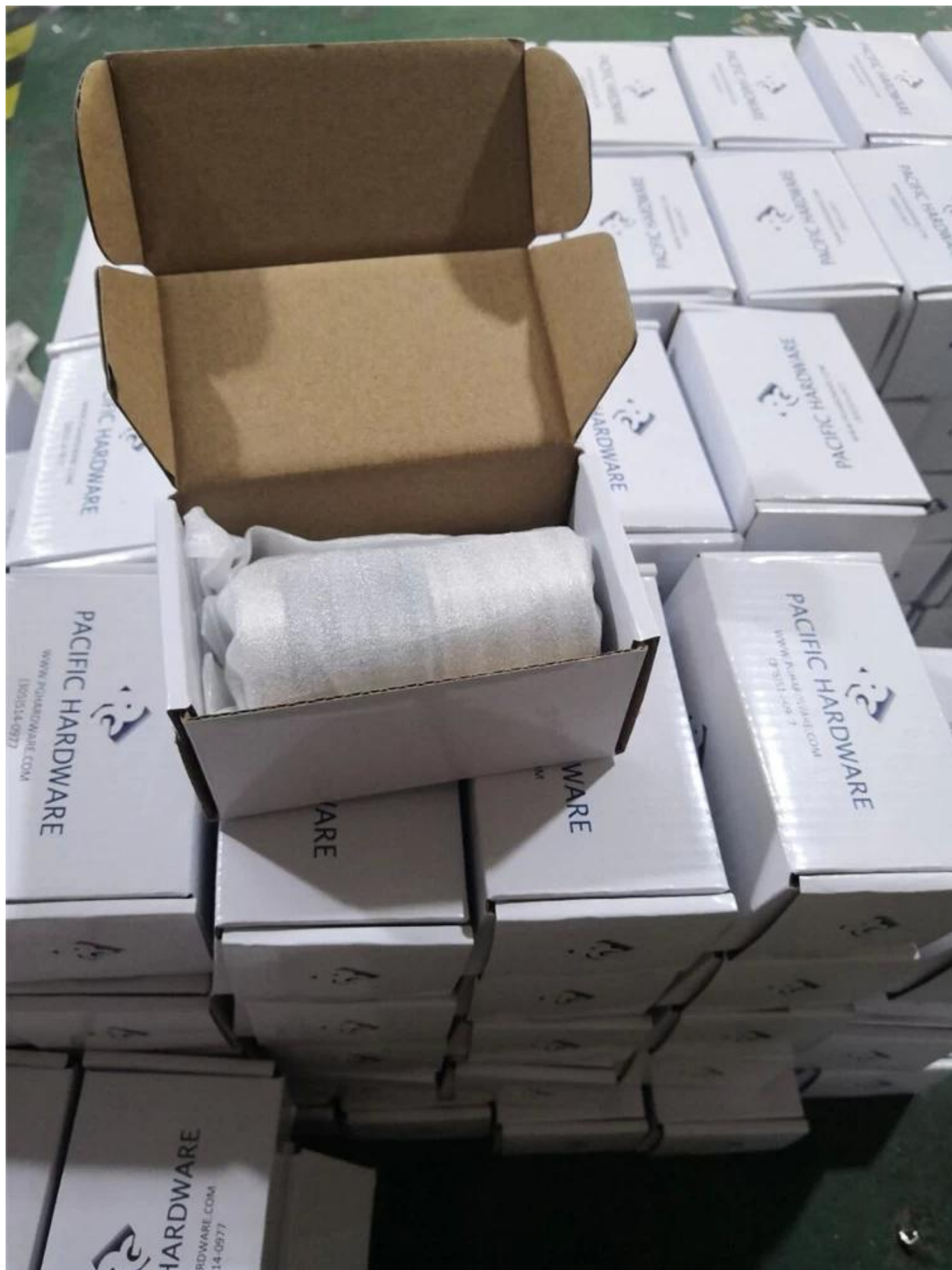
مشروع الصور من الفولاذ المقاوم للصدأ الزجاج المواجهة الزجاج شرفة تصميم حديدي