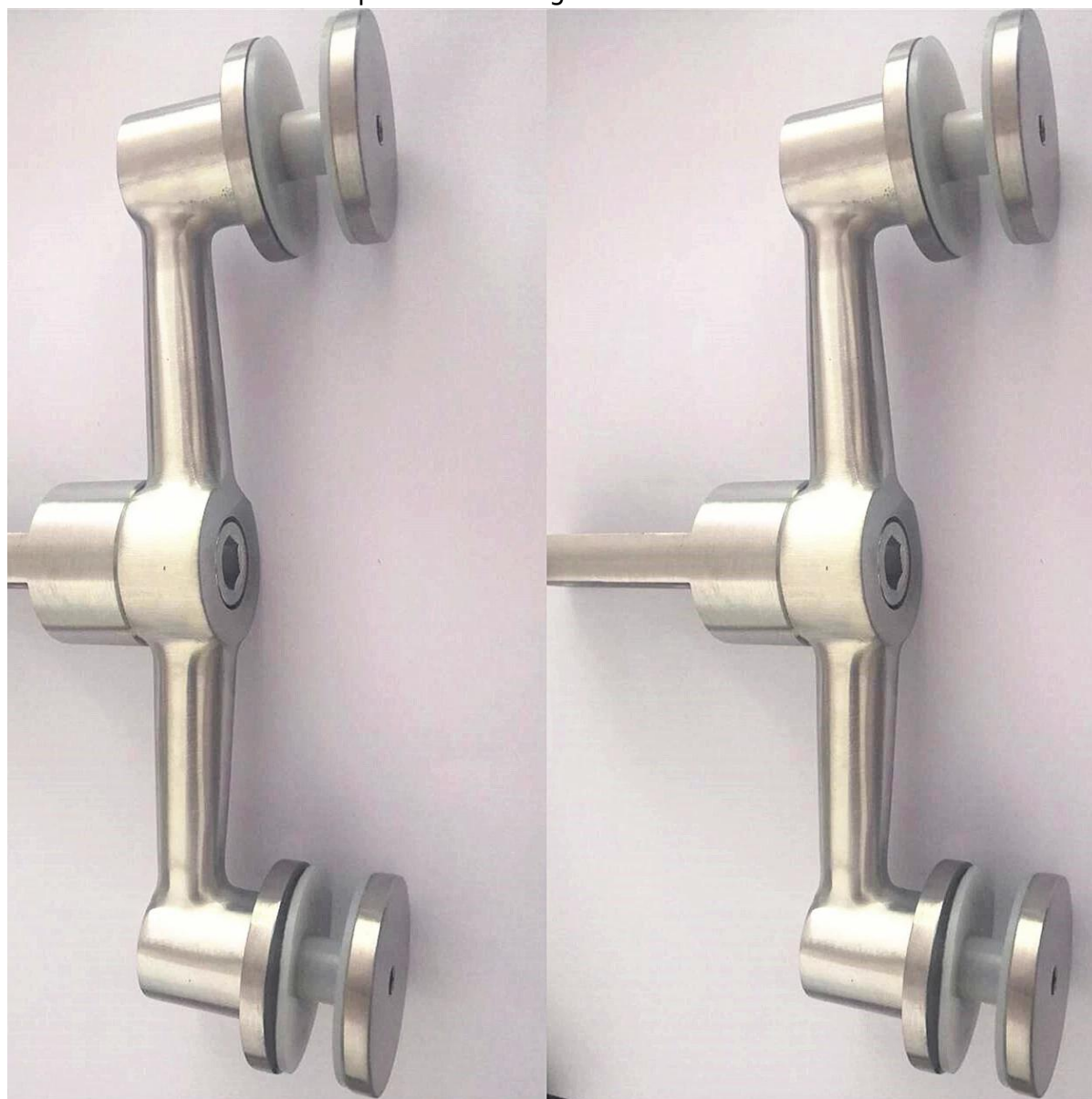
Fotos von Edelstahl-Glas-Spinnenbeschlägen