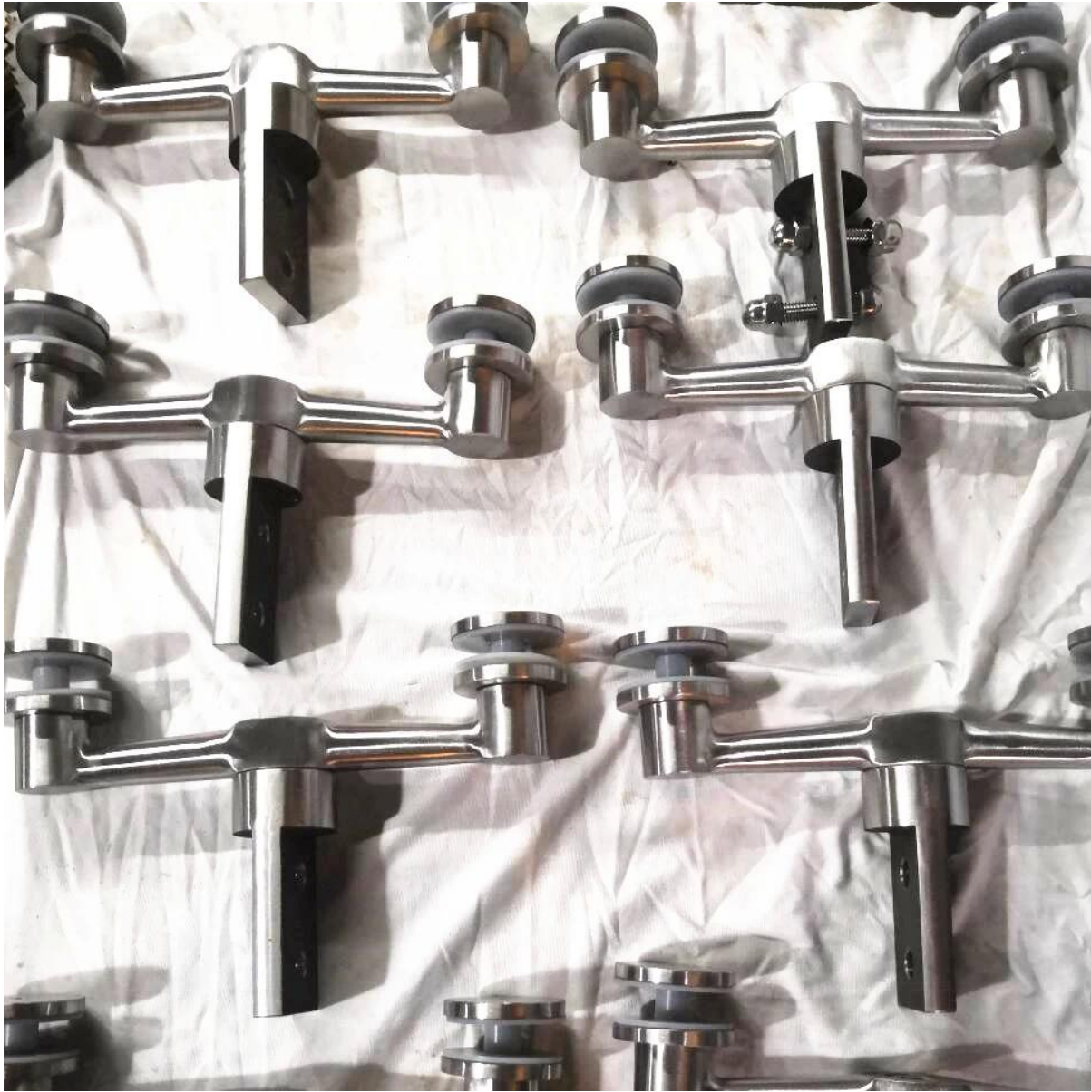
Projektfoto der Glasspinneneinrichtung für Vorhangfassaden -