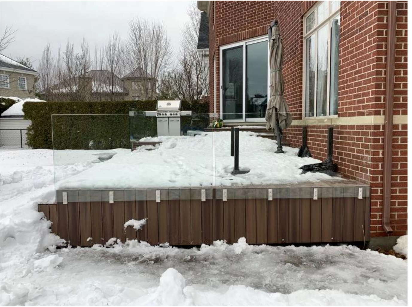
Andere Arten von Glasklemmen