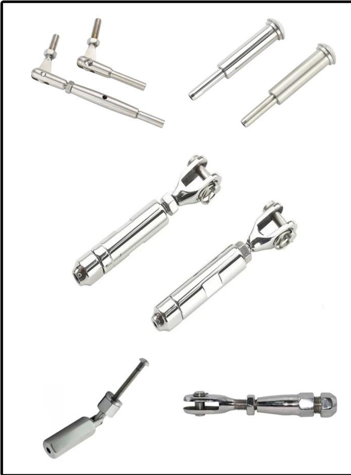
Projekte zeigen: - Faszienmontage Edelstahl-Kabelgeländer für Außendeck