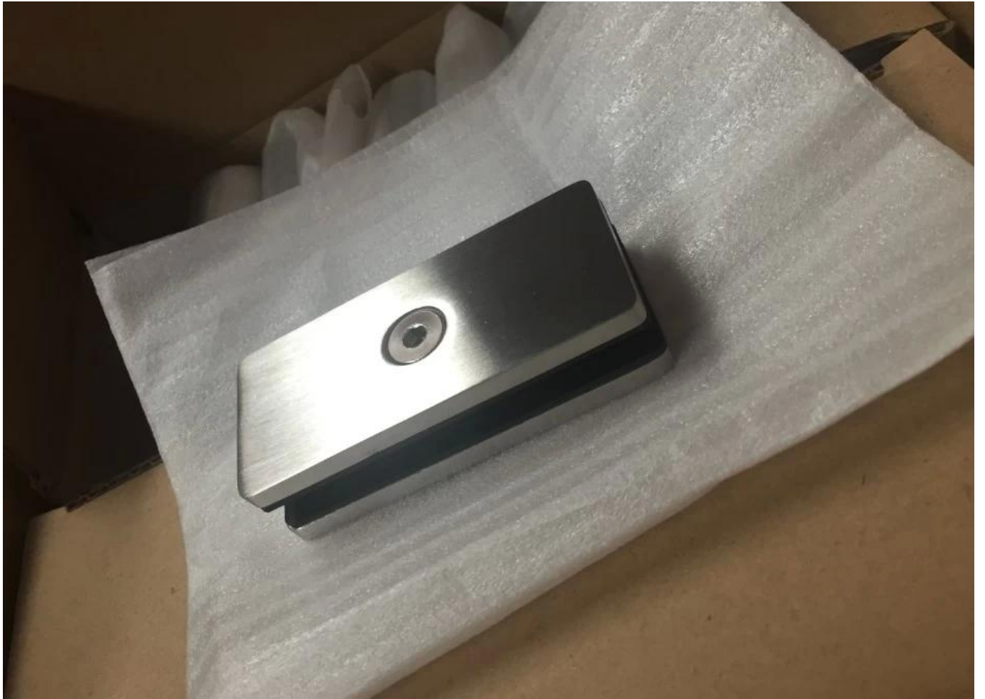
Projektfotos für 180-Grad-Glasklemme