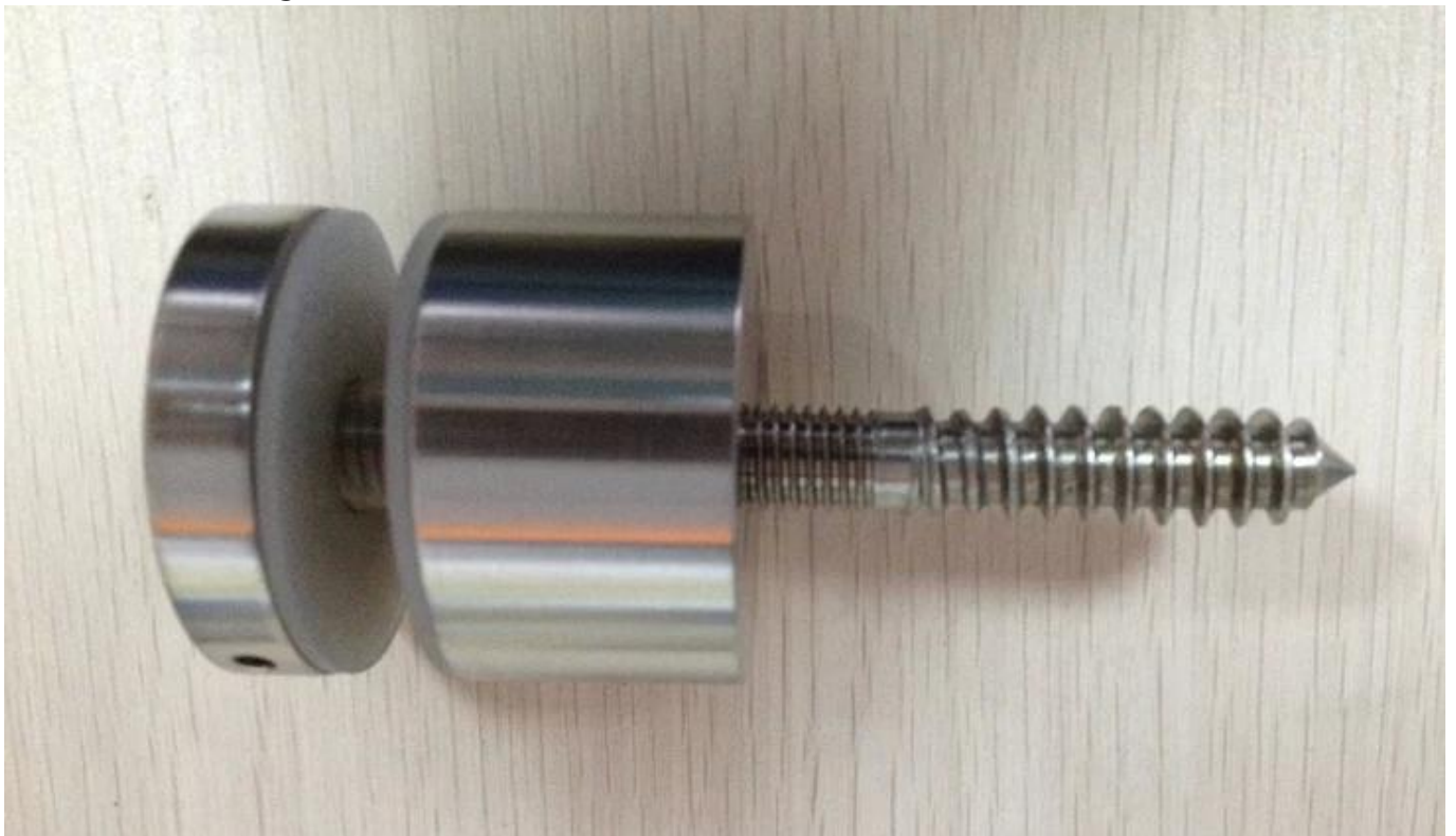
the project pictures