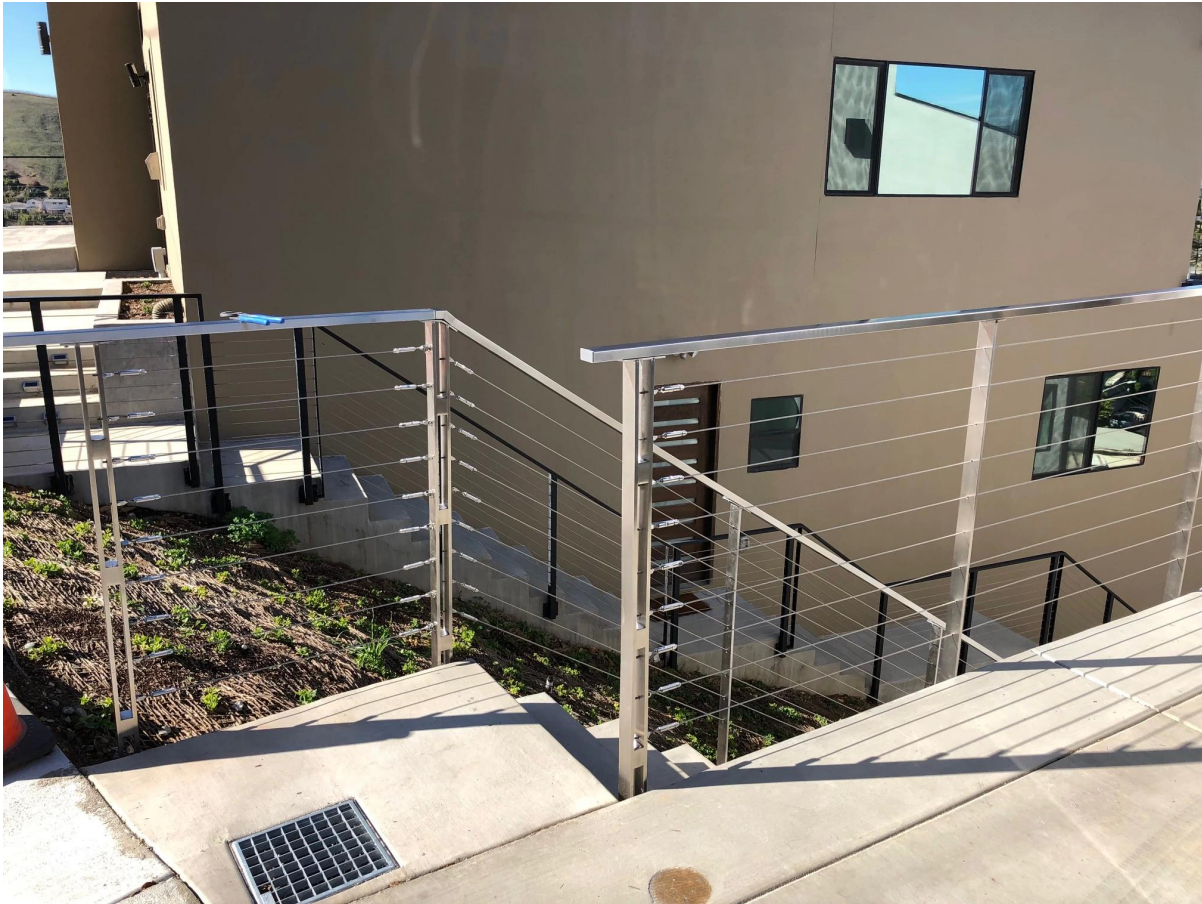
Perfil de la compañía-