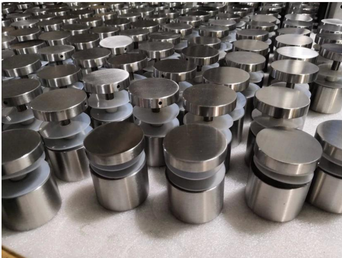
Fotos de instalación de barandillas de separación de vidrio