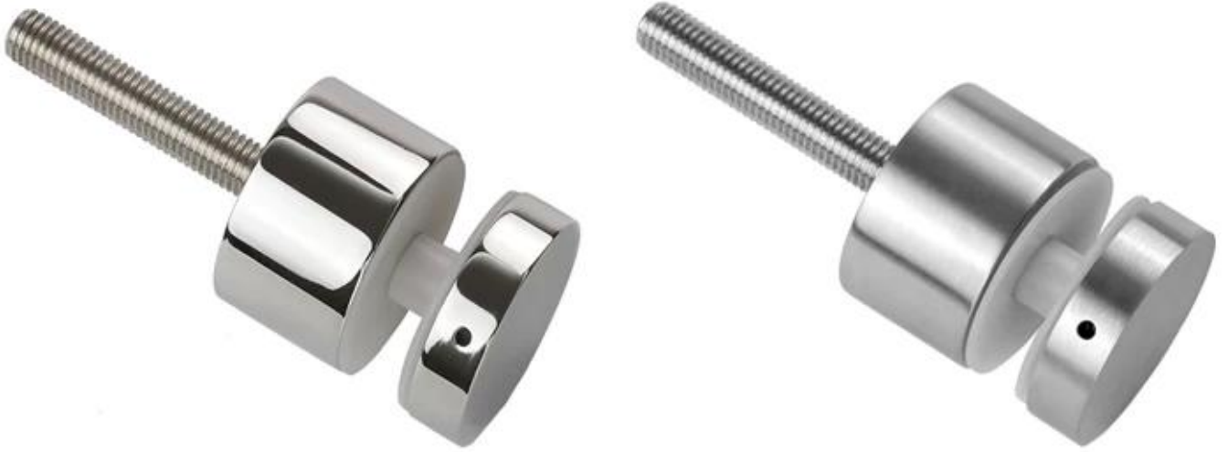
Fotos de producción y empaque de separadores de vidrio -