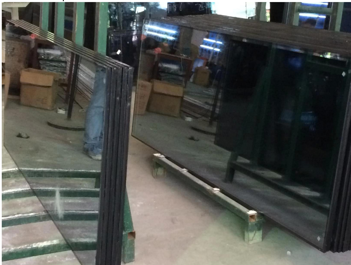
detalles del producto