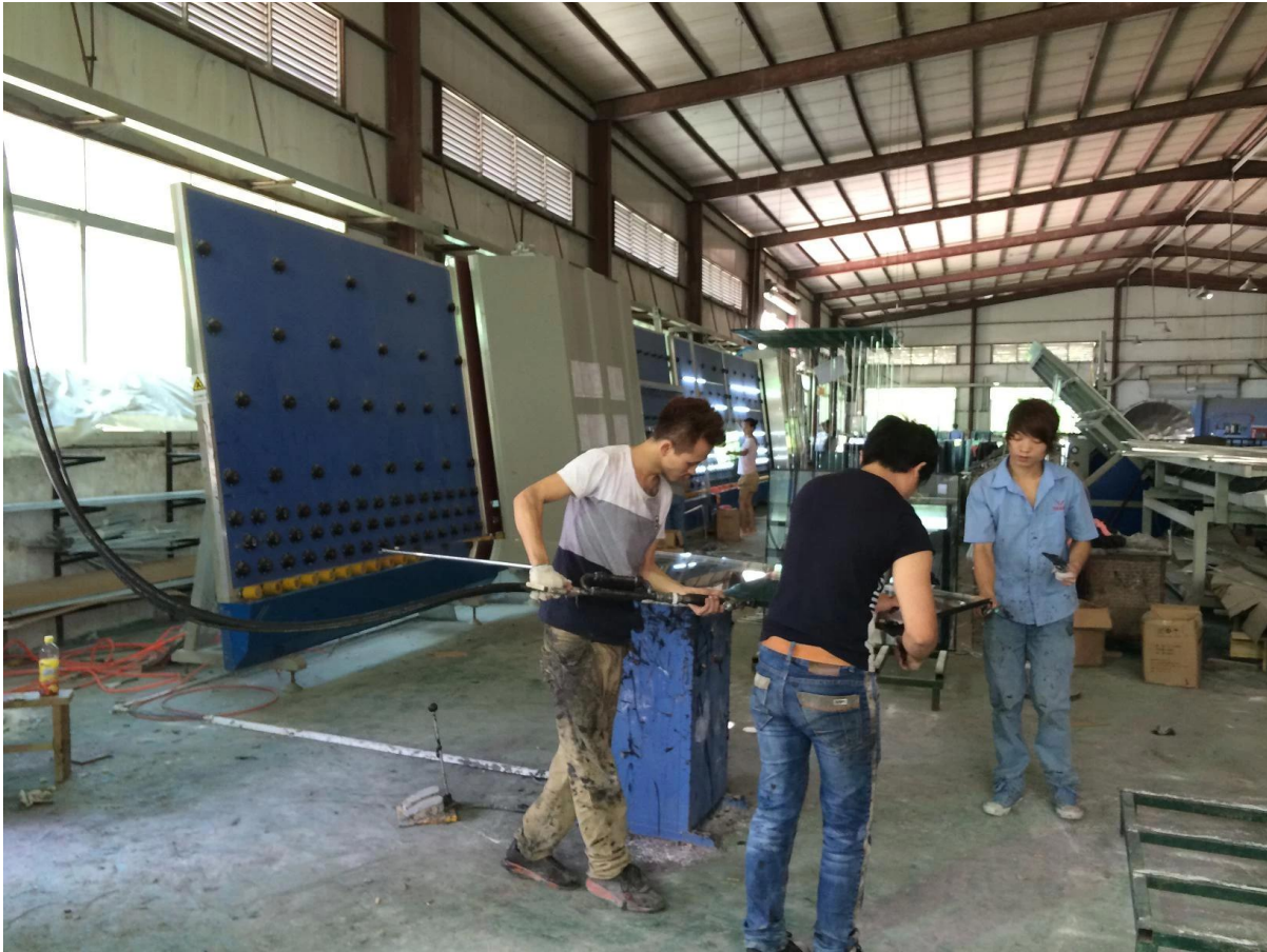
Packaging & Entrega