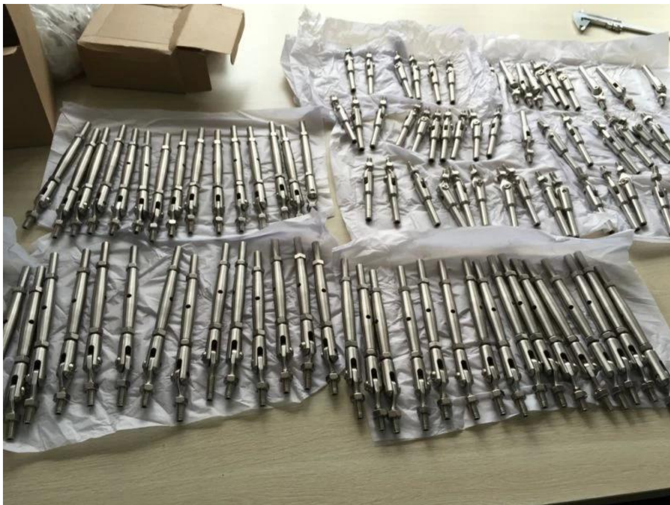
Otrotipos decable tensoressonda disponible