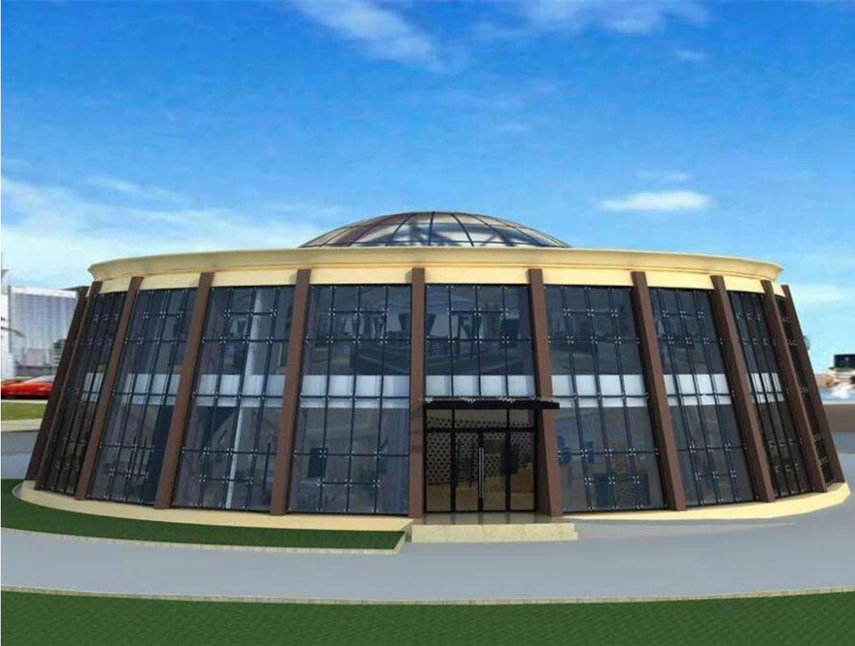
Perfil de la compañía-