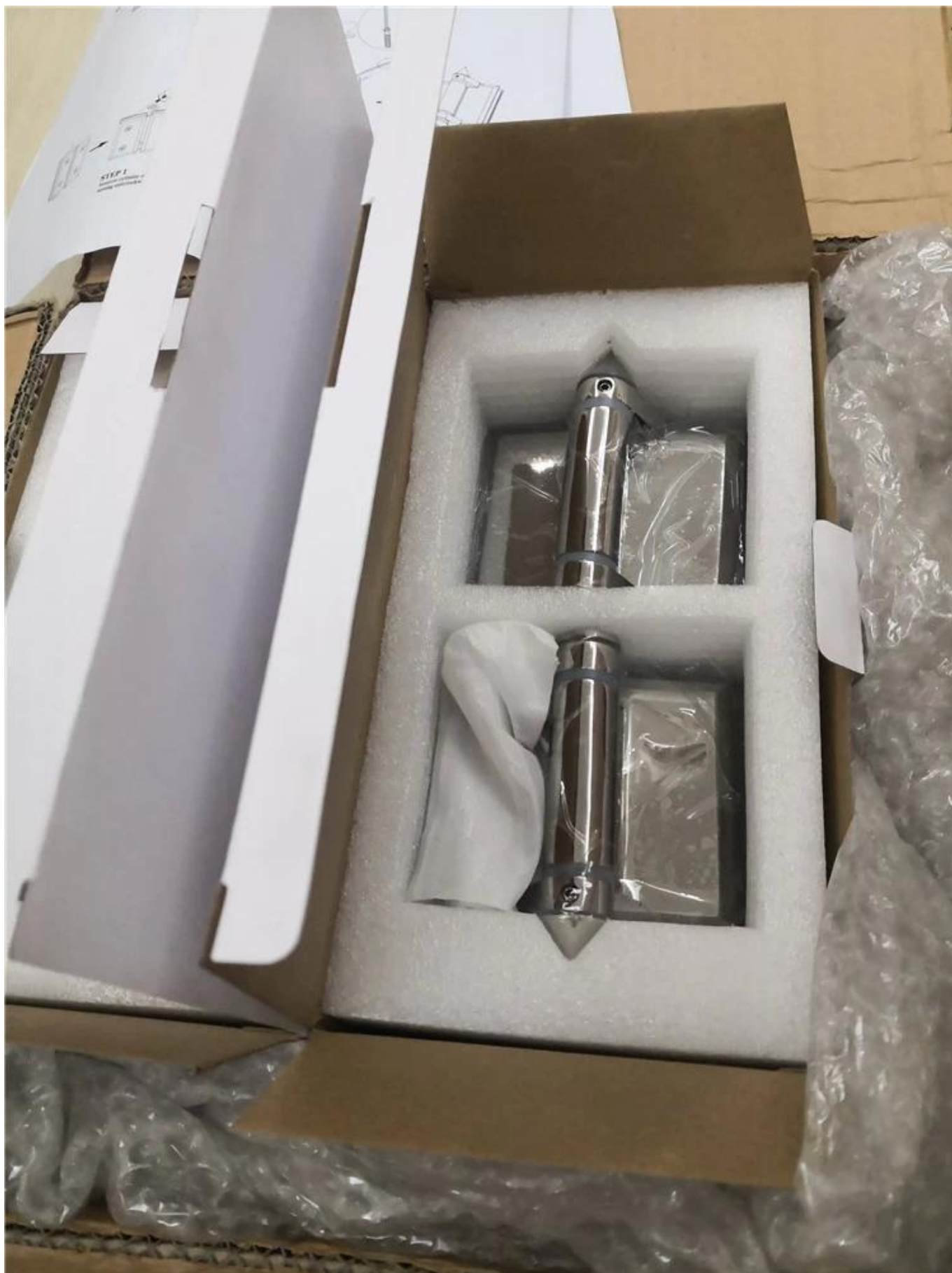
Perfil de la compañía -